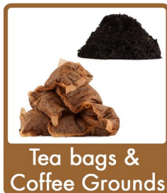
Tea bags & Coffee Grounds