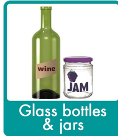
Glass bottles & jars