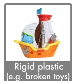
Rigid plastic (e.g. broken toys)