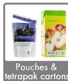
Pouches & tetrapak cartons