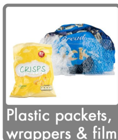
Plastic packets, wrappers & film

Non-recyclable household waste including: