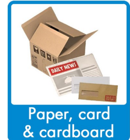
Paper, card & cardboard

Put items loose in your recycling bin. No bags please.