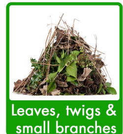
Leaves, twigs & small branches

This is an opt in service. You can choose to have your green bin collected for an annual fee. Find out more and sign up at www.northwarks.gov.uk/green