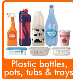
Plastic bottles, pots, tubs & trays