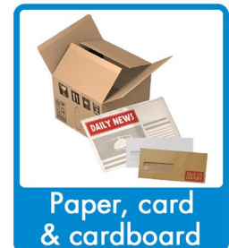
Paper, card & cardboard

Put items loose in your recycling bin. No bags please.