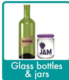
Glass bottles & jars