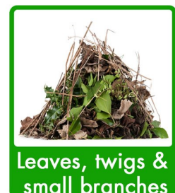
Leaves, twigs & small branches

This is an opt in service. You can choose to have your green bin collected for an annual fee. Find out more and sign up at www.northwarks.gov.uk/green