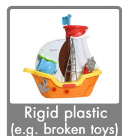
Rigid plastic (e.g. broken toys)