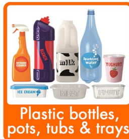
Plastic bottles, pots, tubs & trays