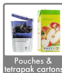
Pouches & tetrapak cartons