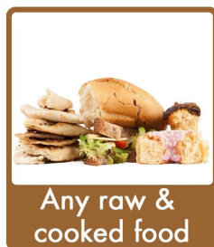
Any raw & cooked food