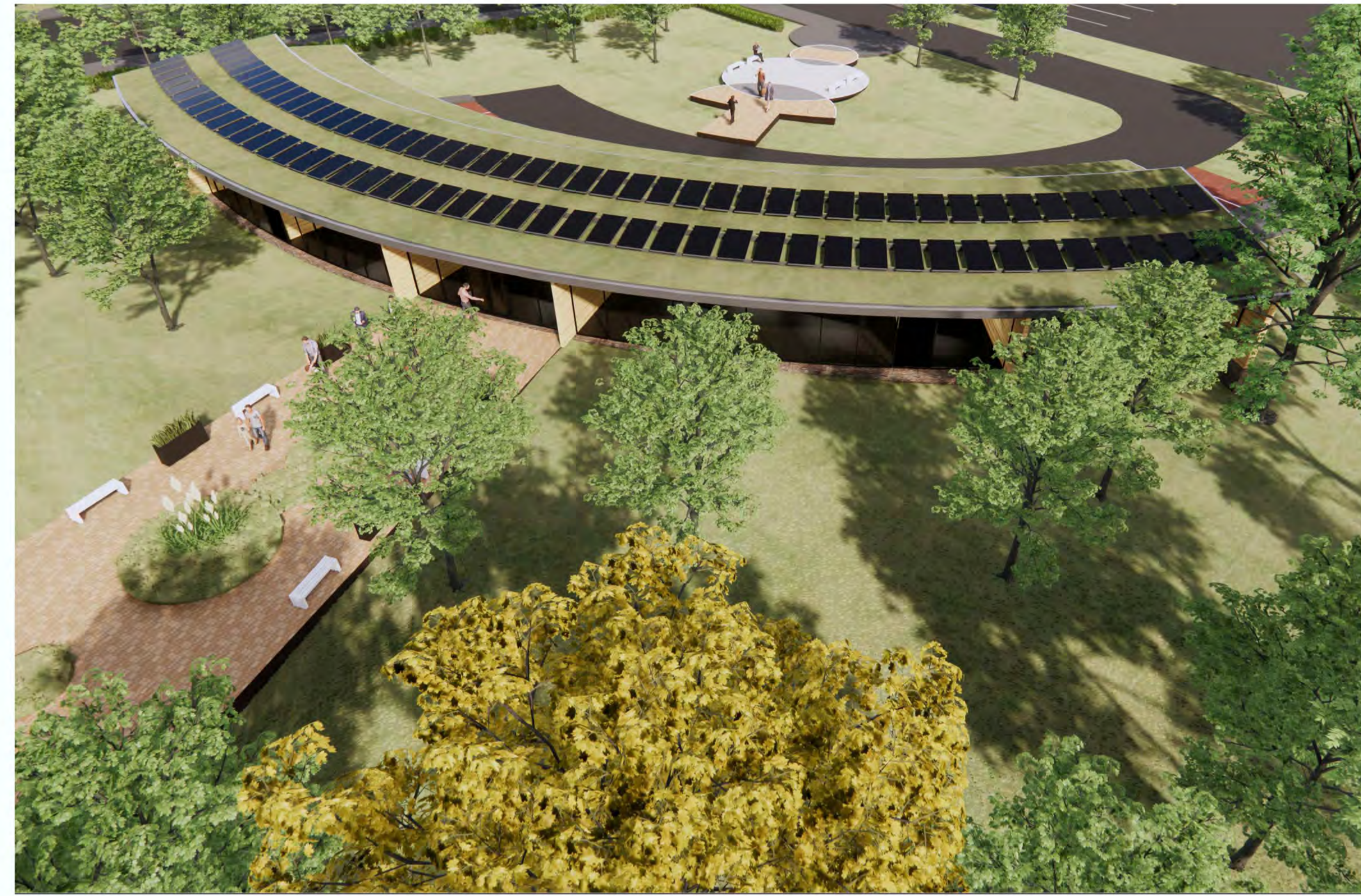
PROPOSED AERIAL VIEW SCALE - N/A