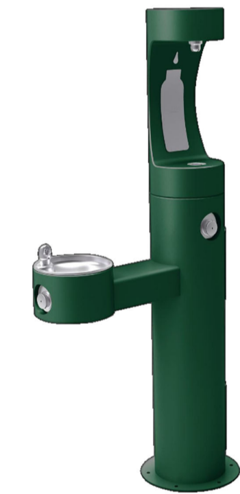
Outdoor Drinking Fountain