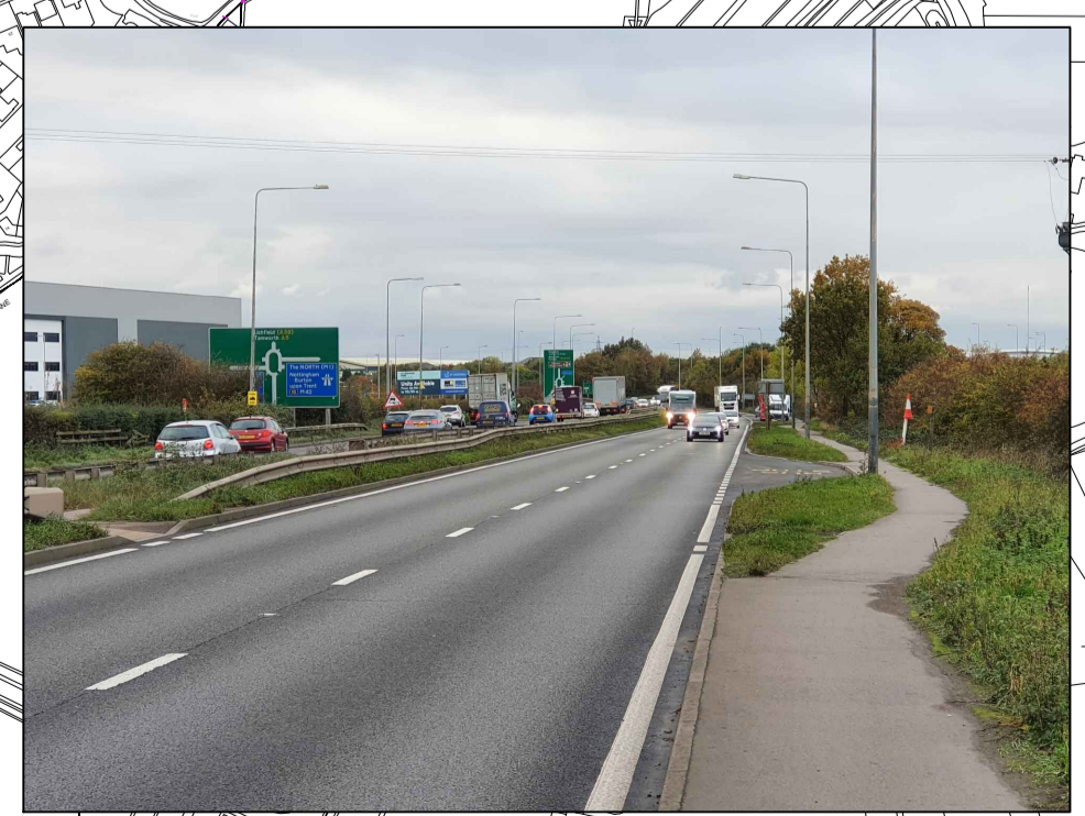
Existing Pinch Point on A5 Pavement / Cycleway at Bus Stop North of A5