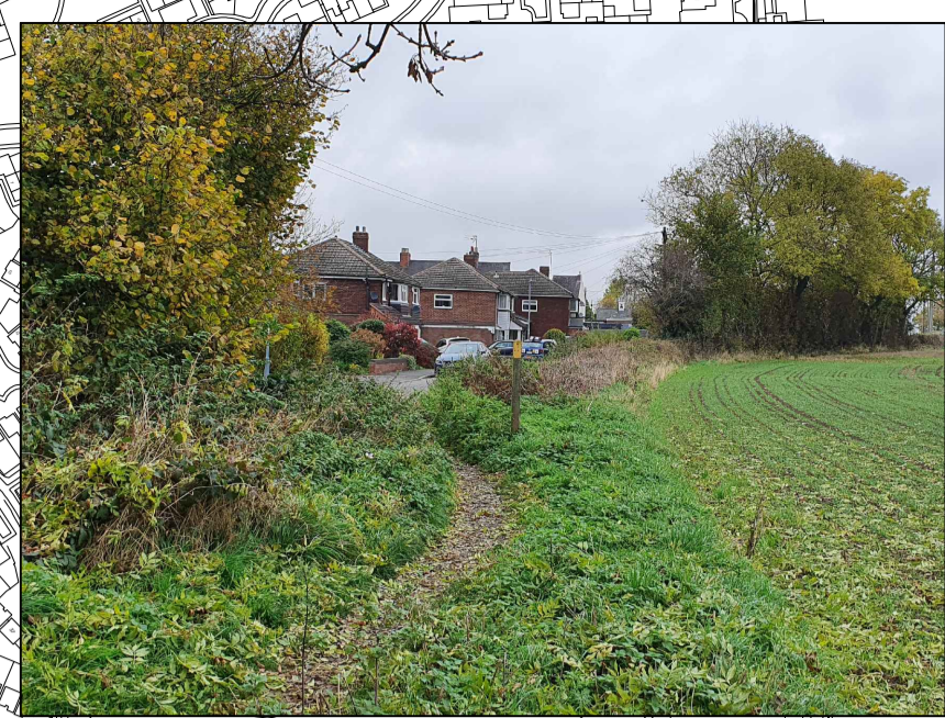
Access / egress from Cocksbur Street, Birchmoor (Public Bridleway AE45)