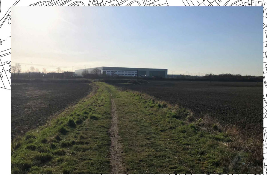
Gravel / dirt farm track (Public Bridleway AE45)