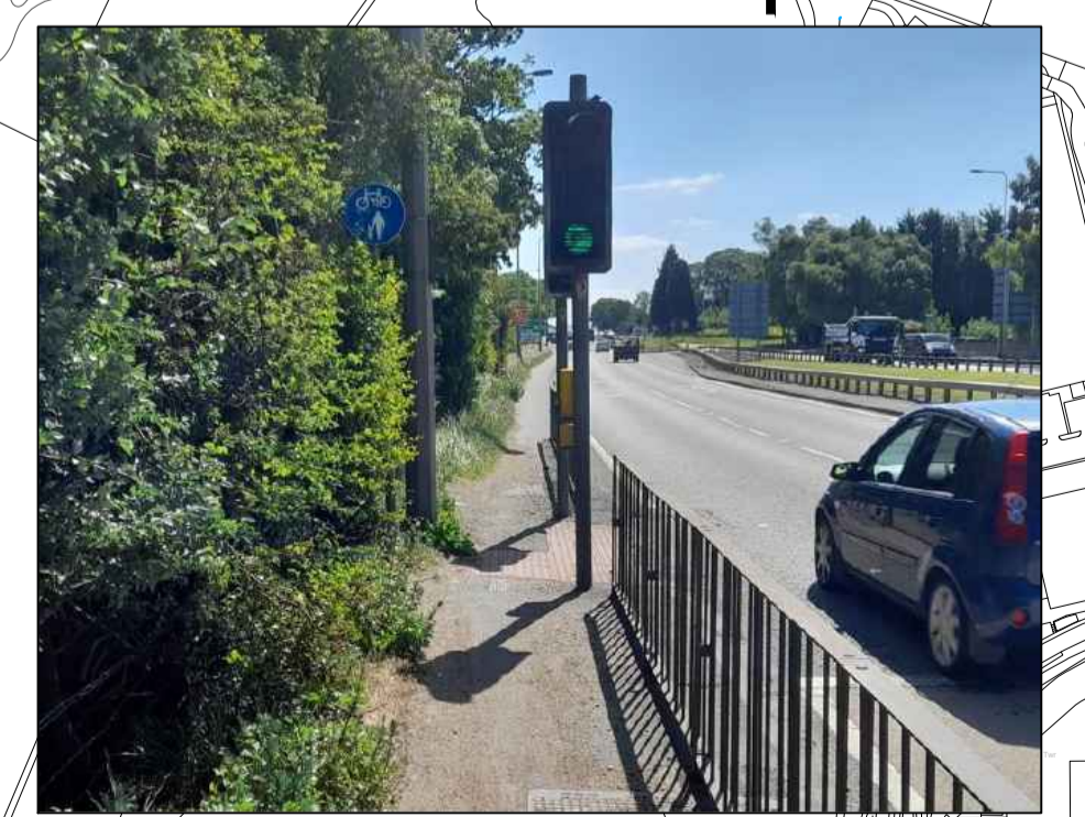
Existing Pinch Point on A5 Pavement / Cycleway at Birch Coppice Junction