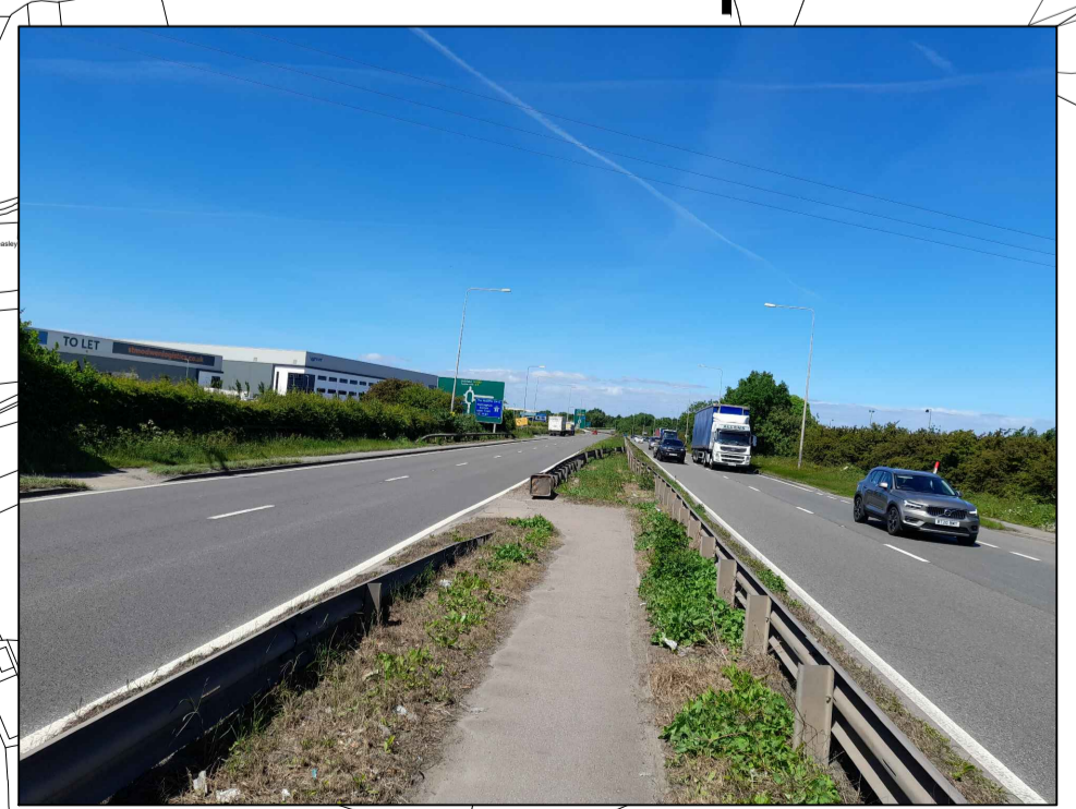
Existing Uncontrolled Staggered Pedestrian A5 Crossing - View West