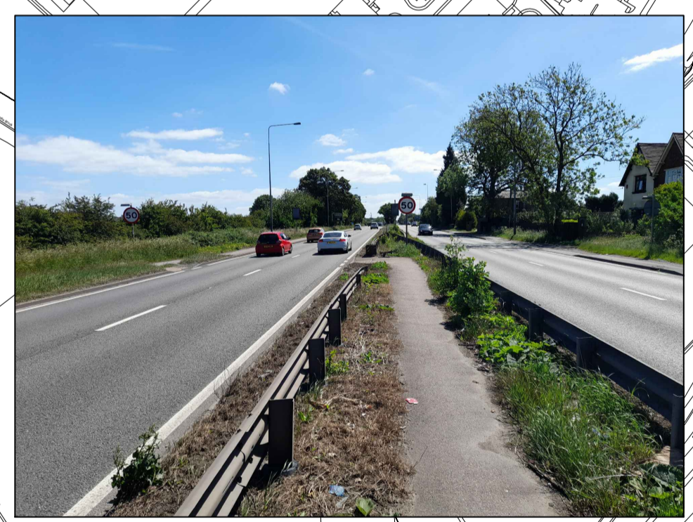
Existing Uncontrolled Staggered Pedestrian A5 Crossing - View East