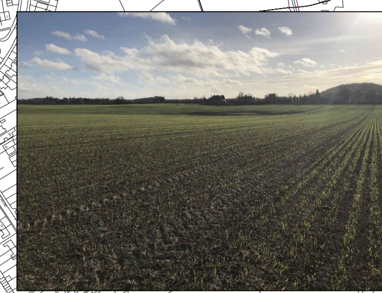
Route Through Arable Field - View South (Public Footpath AE46)