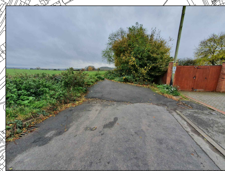
Access / egress from Cocksbur Street, Birchmoor (Public Bridleway AE45)