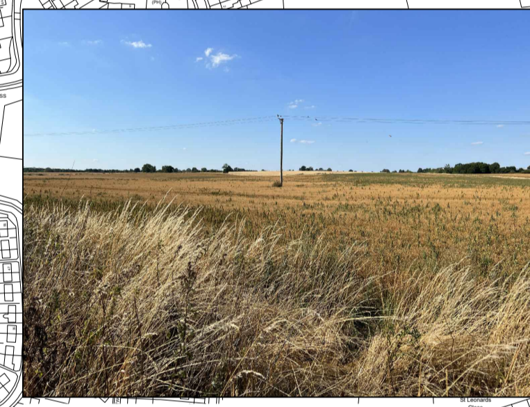
Route Through Arable Field - View North (Public Footpath AE46)