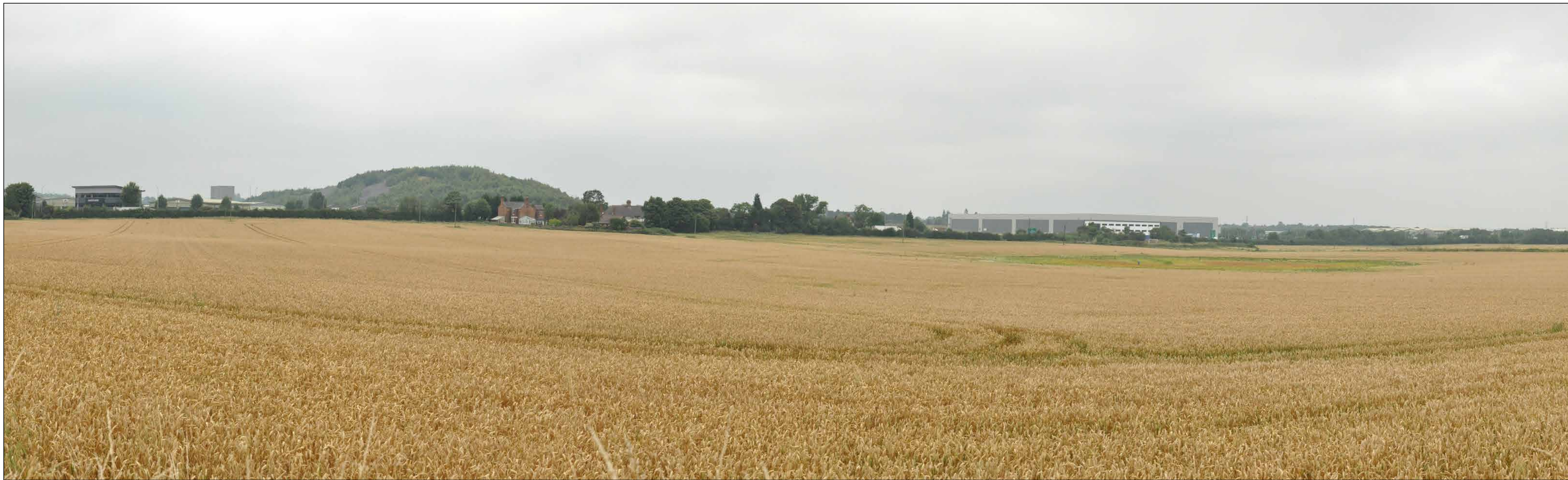
VIEWPOINT: 4 LOOKING SOUTH-WEST TOWARDS THE SITE FROM PROW AE46.

PROJECTION: CYLINDRICAL DATE AND TIME OF PHOTOGRAPHY: 14.08.2020 AT 10:50 ENLARGEMENT FACTOR: 96% AT A1 MAKE AND MODEL OF CAMERA: NIKON D90 VIEW AT COMFORTABLE ARM'S LENGTH MAKE AND FOCAL LENGTH OF LENS: NIKON 35MM TO BE PRINTED AT A1 FOR ASSESSMENT DIRECTION OF VIEW: SOUTH-WEST VIEWING BOX INCORPORATES UP TO 90° HORIZONTAL FIELD OF VIEW