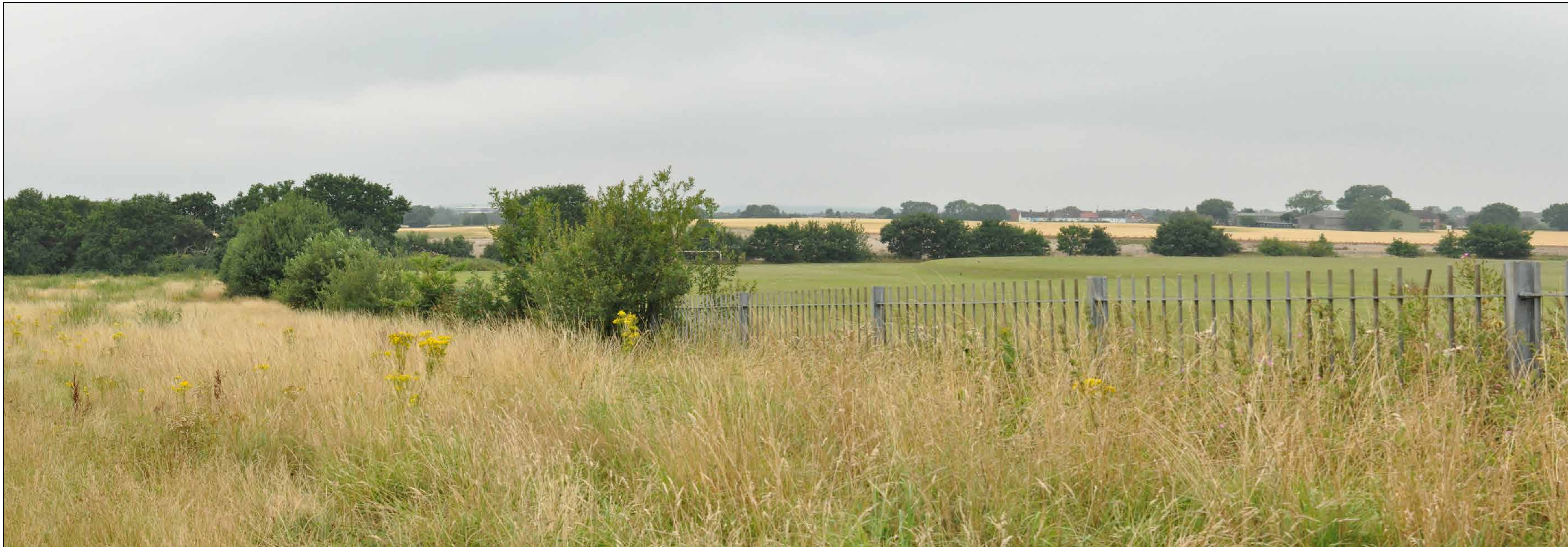
VIEWPOINT: 5 LOOKING NORTH-WEST TOWARDS THE SITE FROM THE EDGE OF DORDON.

TYPE 3 PHOTOGRAPHY SUMMER PHOTOGRAPHY SLR digital environmental solutions HODGETTS ESTATES LAND AT JUNCTION 10, M42 LANDSCAPE AND VISUAL APPRAISAL JOB NO: 403.11077.0001 DATE: NOV 2022 DRAWN: RB CHECKED: EJ APPROVED: JS VIEWPOINT 5 DRAWING NO: LAJ-17