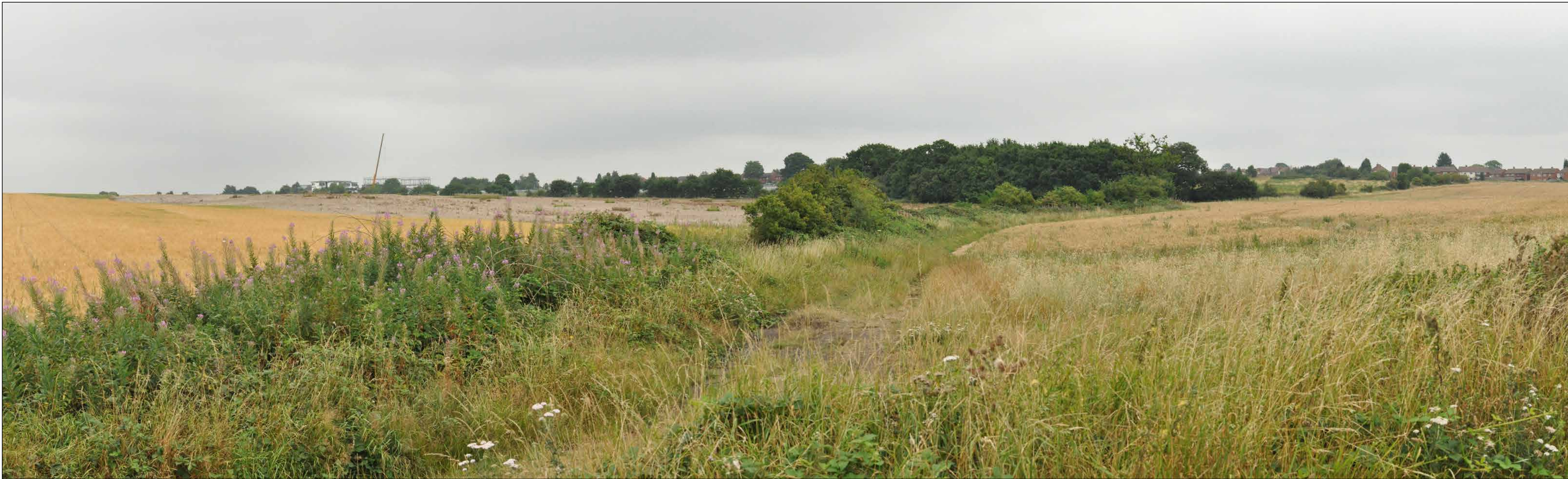
VIEWPOINT: 4 LOOKING NORTH-EAST TOWARDS ST HELENA FROM PROW AE46.

PROJECTION: CYLINDRICAL DATE AND TIME OF PHOTOGRAPHY: 14.08.2020 AT 10:50 ENLARGEMENT FACTOR: 96% AT A1 MAKE AND MODEL OF CAMERA: NIKON D90 VIEW AT COMFORTABLE ARM'S LENGTH MAKE AND FOCAL LENGTH OF LENS: NIKON 35MM TO BE PRINTED AT A1 FOR ASSESSMENT DIRECTION OF VIEW: NORTH-EAST VIEWING BOX INCORPORATES UP TO 90° HORIZONTAL FIELD OF VIEW