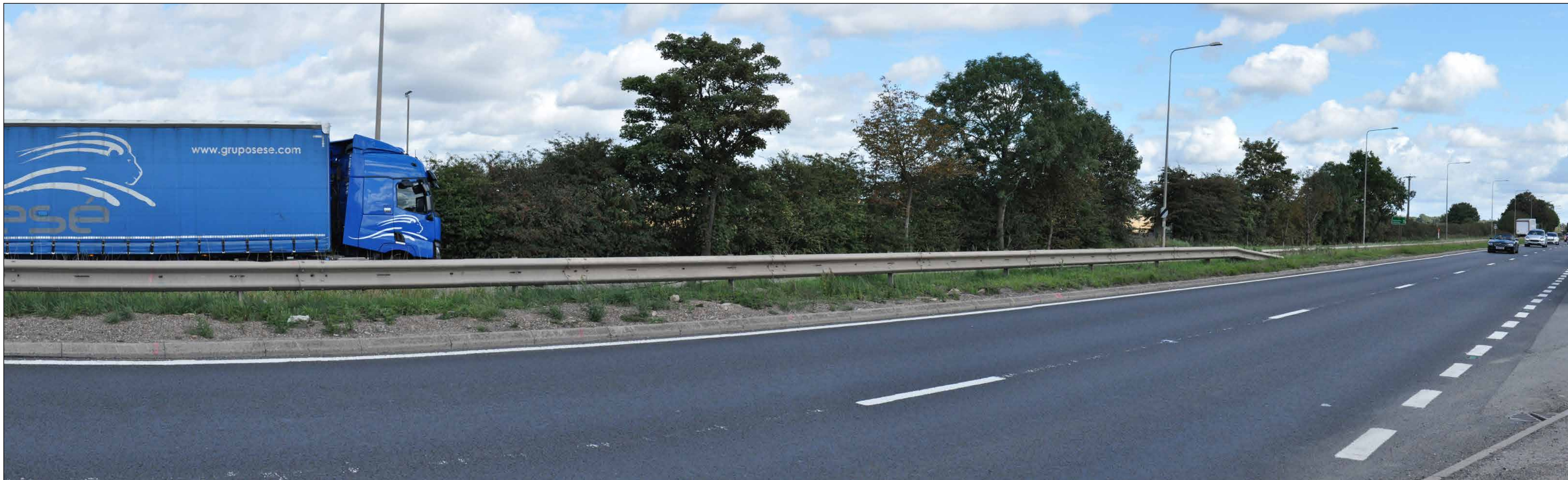
VIEWPOINT: 11 LOOKING NORTH-EAST TOWARDS DORDON FROM WHERE PROW AE55 MEETS WATLING STREET.

SLR HODGETTS ESTATES TYPE 3 PHOTOGRAPHY SUMMER PHOTOGRAPHY LAND AT JUNCTION 10, M42 LANDSCAPE AND VISUAL APPRAISAL JOB NO: 403.11077.0001 DATE: NOV 2022 DRAWN: RB CHECKED: EJ APPROVED: JS VIEWPOINT 11 DRAWING NO: LAJ-27