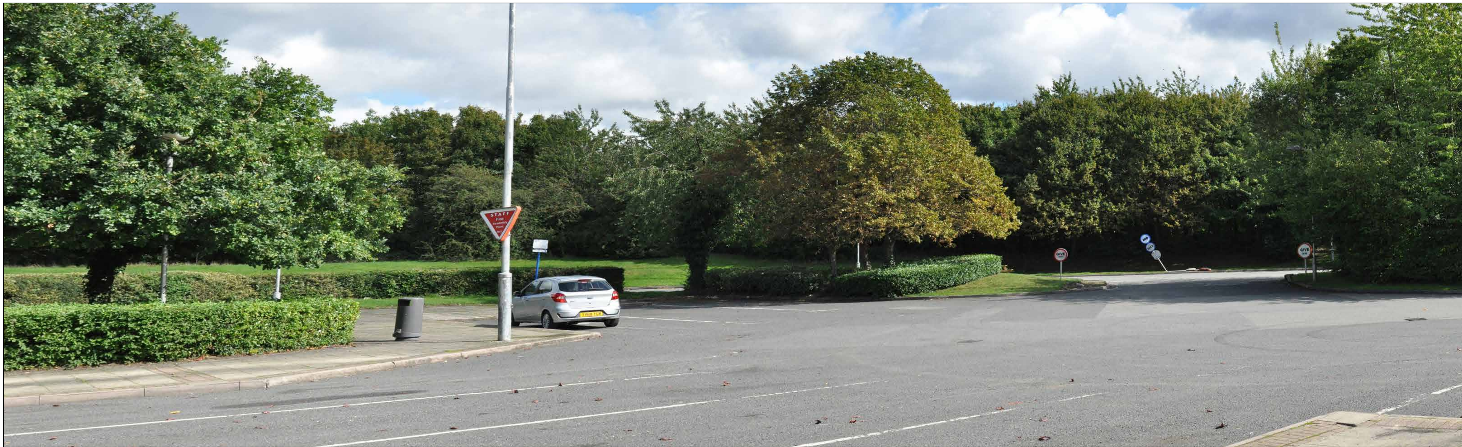
VIEWPOINT: 14 LOOKING EAST TOWARDS THE SITE FROM TAMWORTH MOTORWAY SERVICES.

PROJECTION: CYLINDRICAL DATE AND TIME OF PHOTOGRAPHY: 06.09.2020 AT 13:35 ENLARGEMENT FACTOR: 96% AT A1 MAKE AND MODEL OF CAMERA: NIKON D90 VIEW AT COMFORTABLE ARM'S LENGTH MAKE AND FOCAL LENGTH OF LENS: NIKON 35MM TO BE PRINTED AT A1 FOR ASSESSMENT DIRECTION OF VIEW: EAST VIEWING BOX INCORPORATES UP TO 90° HORIZONTAL FIELD OF VIEW