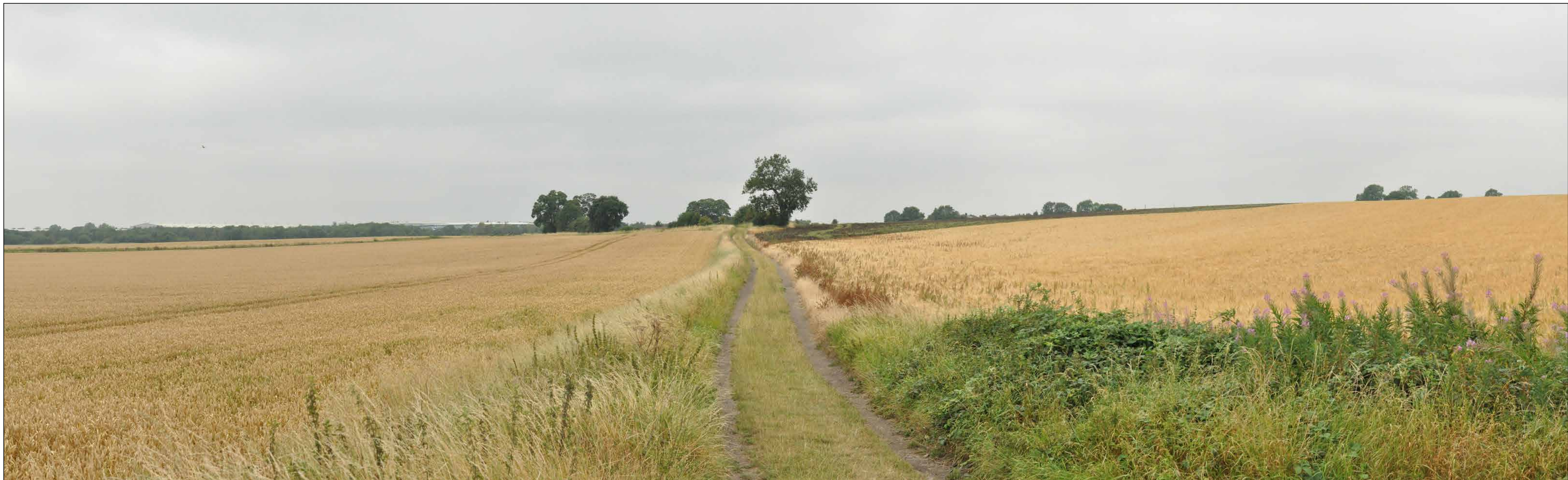
VIEWPOINT: 4 LOOKING NORTH-WEST TOWARDS THE SITE FROM PROW AE46.

SLR HODGETTS ESTATES TYPE 3 PHOTOGRAPHY SUMMER PHOTOGRAPHY LAND AT JUNCTION 10, M42 LANDSCAPE AND VISUAL APPRAISAL JOB NO: 403.11077.0001 DATE: NOV 2022 DRAWN: RB CHECKED: EJ APPROVED: JS VIEWPOINT 4 DRAWING NO: LAJ-13