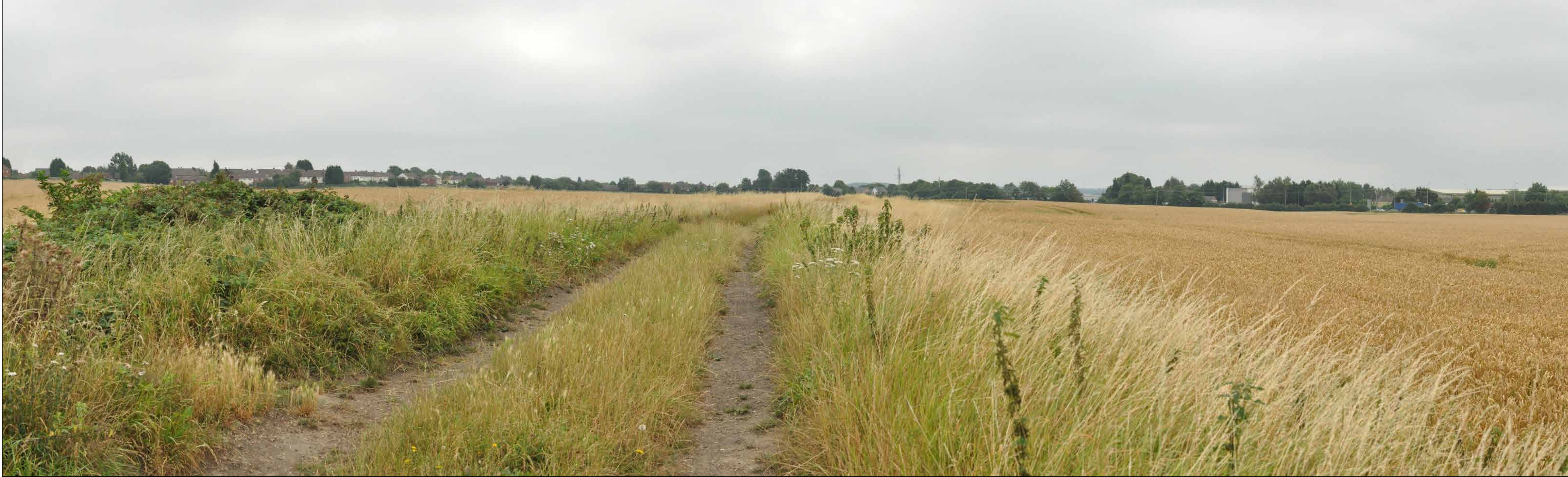
VIEWPOINT: 4 LOOKING SOUTH-EAST TOWARDS DORDON FROM PROW AE46.

SLR HODGETTS ESTATES TYPE 3 PHOTOGRAPHY LAND AT JUNCTION 10, M42 LANDSCAPE AND VISUAL APPRAISAL JOB NO: 403.11077.0001 DATE: NOV 2022 DRAWN: RB CHECKED: EJ APPROVED: JS VIEWPOINT 4 DRAWING NO: LAJ-15