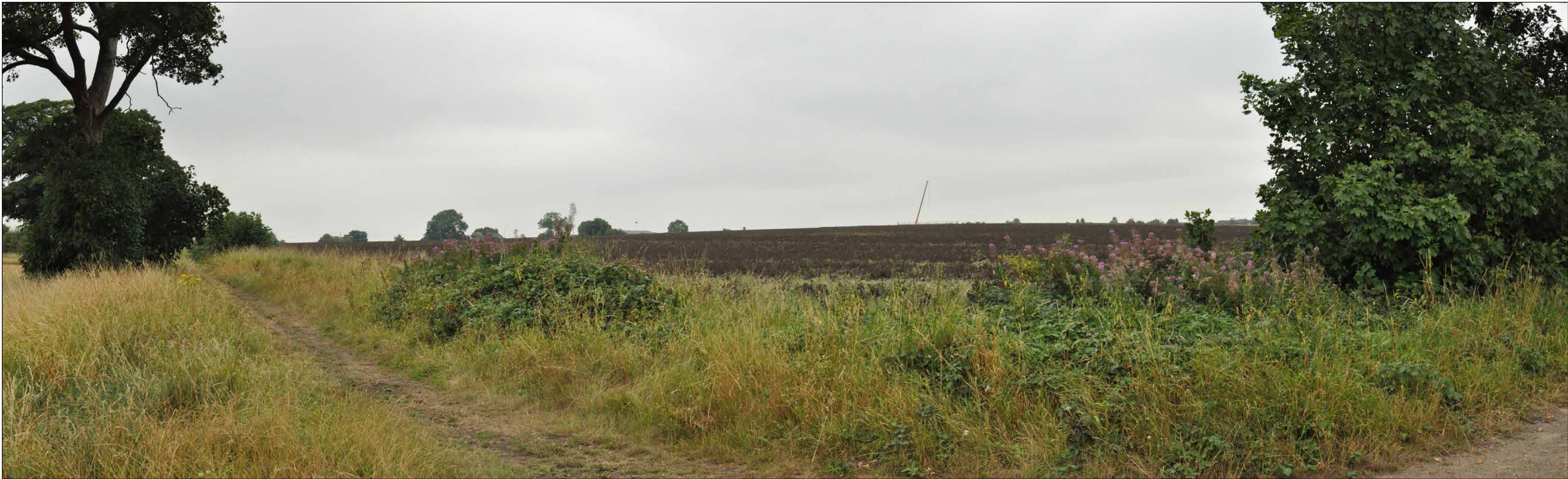
VIEWPOINT: 3 LOOKING NORTH-EAST TOWARDS ST HELENA FROM WHERE PROW AE45 MEETS AE46.

PROJECTION: CYLINDRICAL ENLARGEMENT FACTOR: 96% AT A1 VIEW AT COMFORTABLE ARM'S LENGTH TO BE PRINTED AT A1 FOR ASSESSMENT VIEWING BOX INCORPORATES UP TO 90° HORIZONTAL FIELD OF VIEW