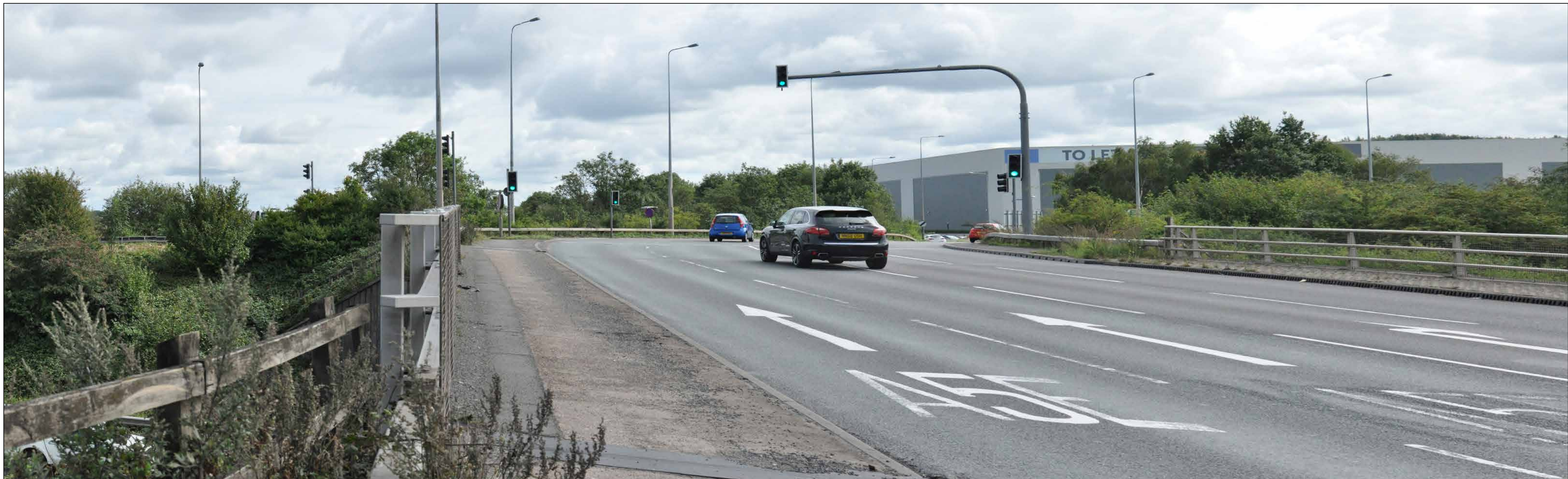
VIEWPOINT: 13 LOOKING SOUTH-EAST TOWARDS THE SITE FROM THE FOOTPATH AT JUNCTION 10.

SLR HODGETTS ESTATES TYPE 3 PHOTOGRAPHY SUMMER PHOTOGRAPHY LAND AT JUNCTION 10, M42 LANDSCAPE AND VISUAL APPRAISAL JOB NO: 403.11077.0001 DATE: NOV 2022 DRAWN: RB CHECKED: EJ APPROVED: JS VIEWPOINT 13 DRAWING NO: LAJ-31