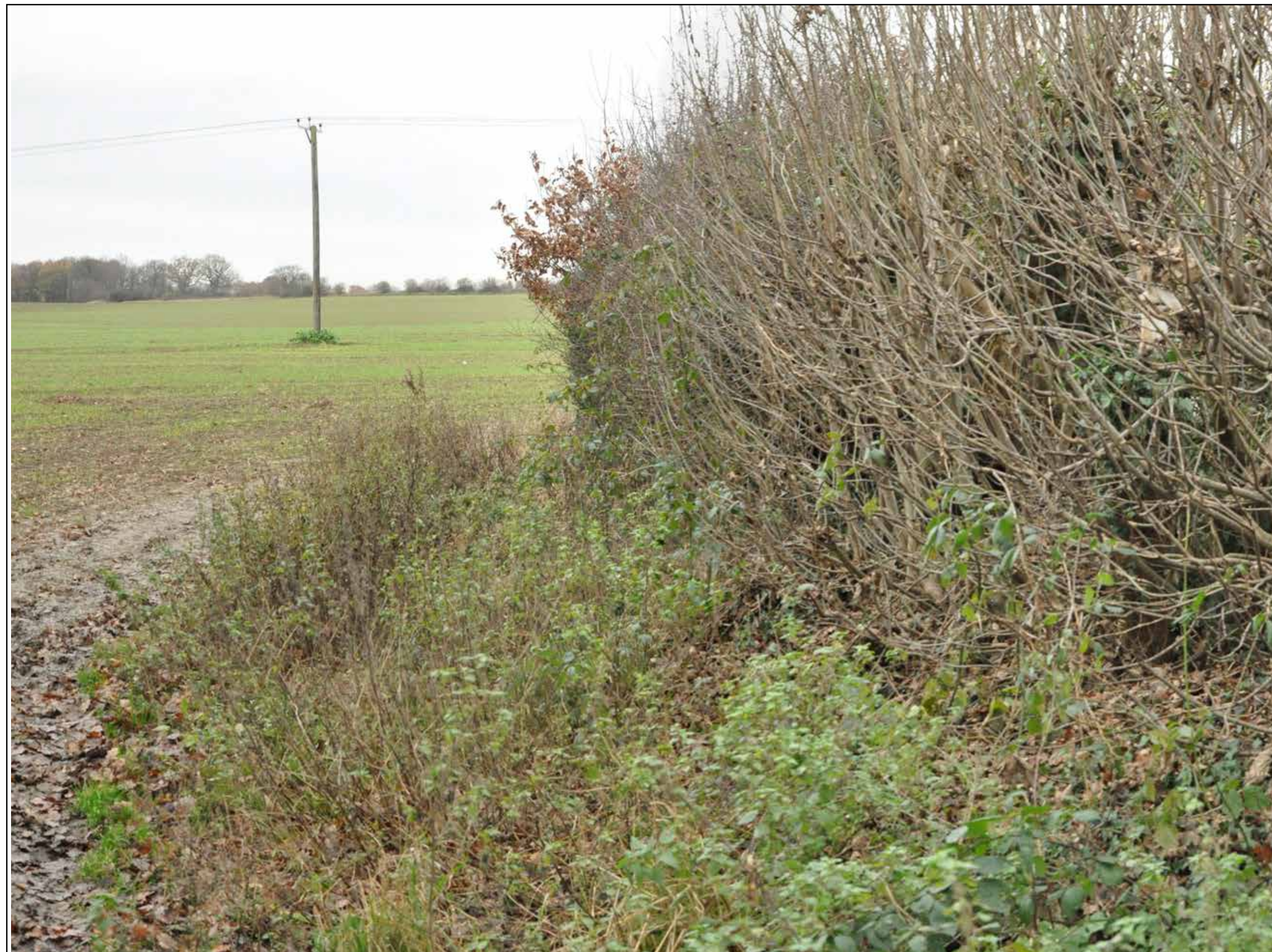
VIEWPOINT: 21 LOOKING NORTH TOWARDS THE SITE FROM FOOTPATH AE48 AT THE EDGE OF BROWN'S LANE.

TYPE 3 PHOTOGRAPHY WINTER PHOTOGRAPHY SLR digital environmental solutions HODGETTS ESTATES LAND AT JUNCTION 10, M42 LANDSCAPE AND VISUAL APPRAISAL JOB NO: 403.11077.0001 DATE: NOV 2022 DRAWN: RB CHECKED: EJ APPROVED: JS VIEWPOINT 21 DRAWING NO: LAJ-47