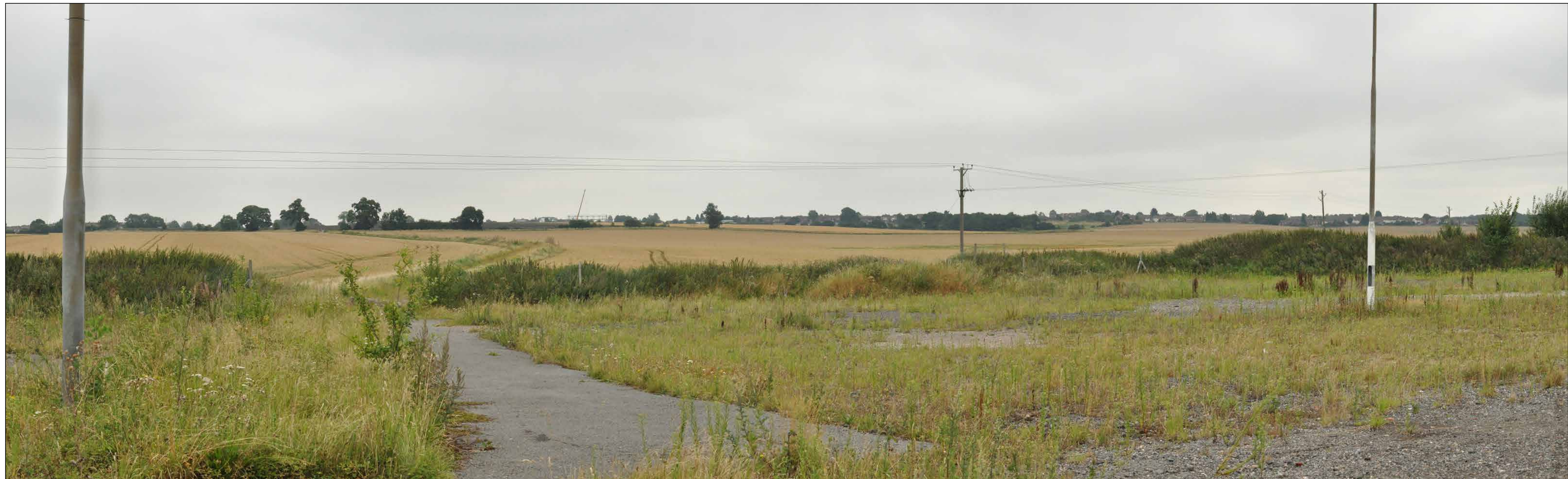
VIEWPOINT: 10 LOOKING NORTH-EAST TOWARDS ST HELENA FROM PROW AE45.

SLR HODGETTS ESTATES TYPE 3 PHOTOGRAPHY LAND AT JUNCTION 10, M42 LANDSCAPE AND VISUAL APPRAISAL JOB NO: 403.11077.0001 DATE: NOV 2022 DRAWN: RB CHECKED: EJ APPROVED: JS VIEWPOINT 10 DRAWING NO: LAJ-25