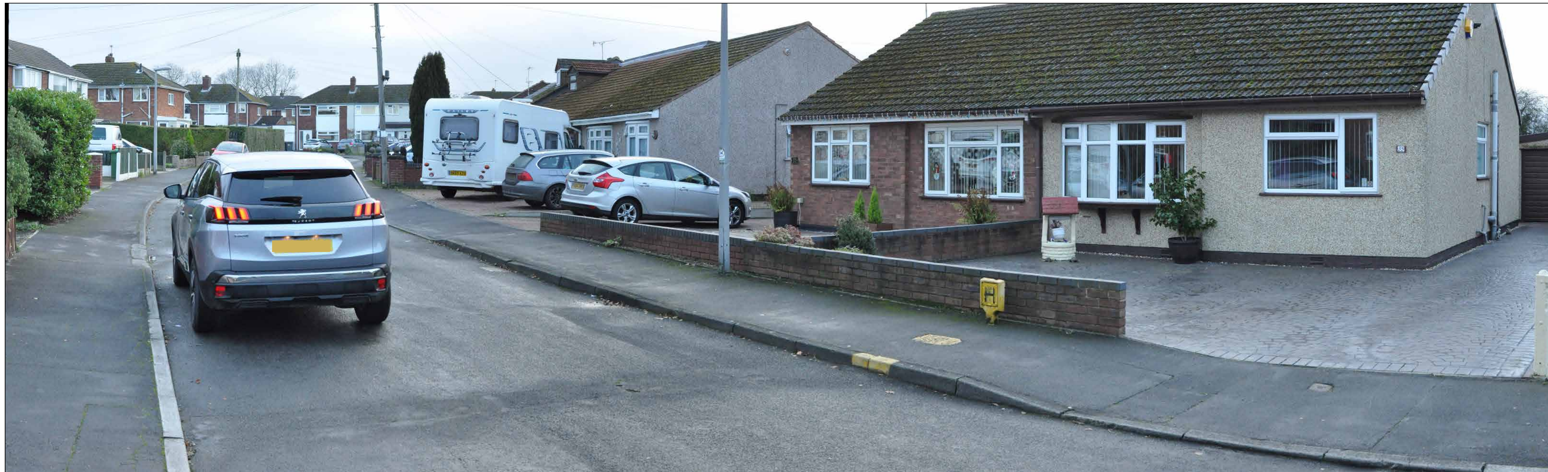
VIEWPOINT: 17 LOOKING EAST TOWARDS THE SITE FROM BETWEEN BUNGALOWS ON BIRCH GROVE.

PROJECTION: CYLINDRICAL ENLARGEMENT FACTOR: 96% AT A1 VIEW AT COMFORTABLE ARM'S LENGTH TO BE PRINTED AT A1 FOR ASSESSMENT VIEWING BOX INCORPORATES UP TO 90° HORIZONTAL FIELD OF VIEW DATE AND TIME OF PHOTOGRAPHY: 10.12.2020 AT 09.53 MAKE AND MODEL OF CAMERA: NIKON D90 MAKE AND FOCAL LENGTH OF LENS: NIKON 35MM DIRECTION OF VIEW: EAST