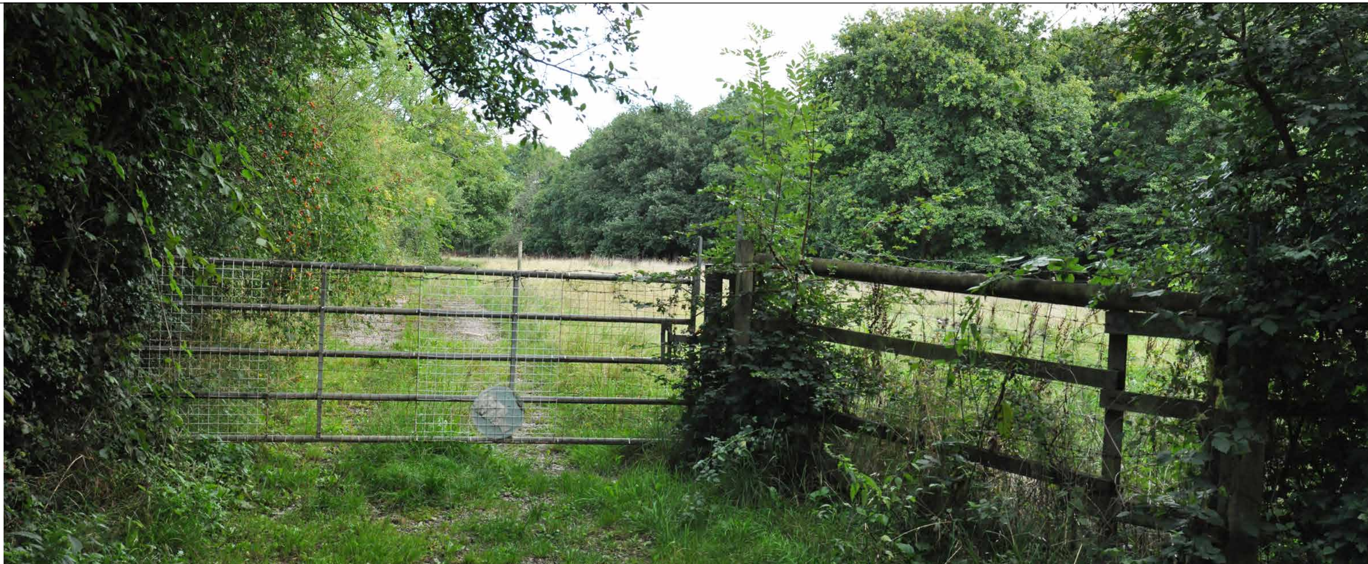
VIEWPOINT: 15 LOOKING EAST TOWARDS THE SITE FROM THE PUBLIC ACCESS ROUTE ALONG GREEN LANE.

PROJECTION: CYLINDRICAL DATE AND TIME OF PHOTOGRAPHY: 06.09.2020 AT 14:55 ENLARGEMENT FACTOR: 96% AT A1 MAKE AND MODEL OF CAMERA: NIKON D90 VIEW AT COMFORTABLE ARM'S LENGTH MAKE AND FOCAL LENGTH OF LENS: NIKON 35MM TO BE PRINTED AT A1 FOR ASSESSMENT DIRECTION OF VIEW: EAST VIEWING BOX INCORPORATES UP TO 90° HORIZONTAL FIELD OF VIEW