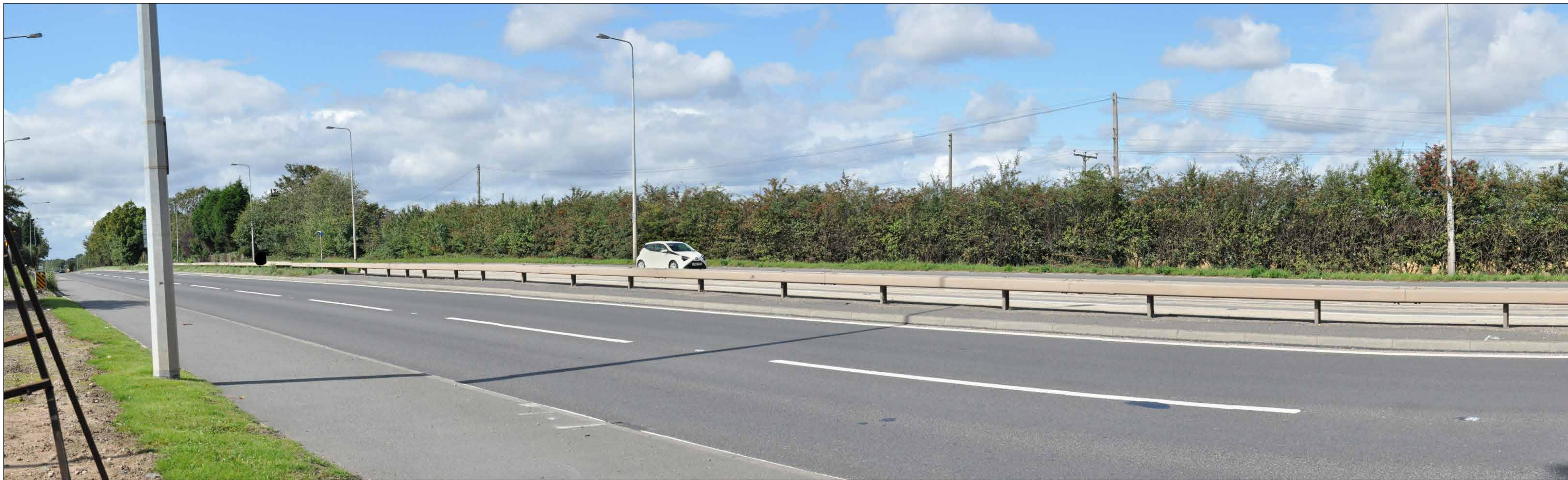
VIEWPOINT: 9 LOOKING NORTH-WEST TOWARDS THE SITE FROM WHERE PROW AE52 MEETS WATLING STREET.

PROJECTION: CYLINDRICAL ENLARGEMENT FACTOR: 96% AT A1 VIEW AT COMFORTABLE ARM'S LENGTH TO BE PRINTED AT A1 FOR ASSESSMENT DATE AND TIME OF PHOTOGRAPHY: 06.09.2020 AT 13:00 MAKE AND MODEL OF CAMERA: NIKON D90 MAKE AND FOCAL LENGTH OF LENS: NIKON 35MM DIRECTION OF VIEW: NORTH-WEST VIEWING BOX INCORPORATES UP TO 90° HORIZONTAL FIELD OF VIEW