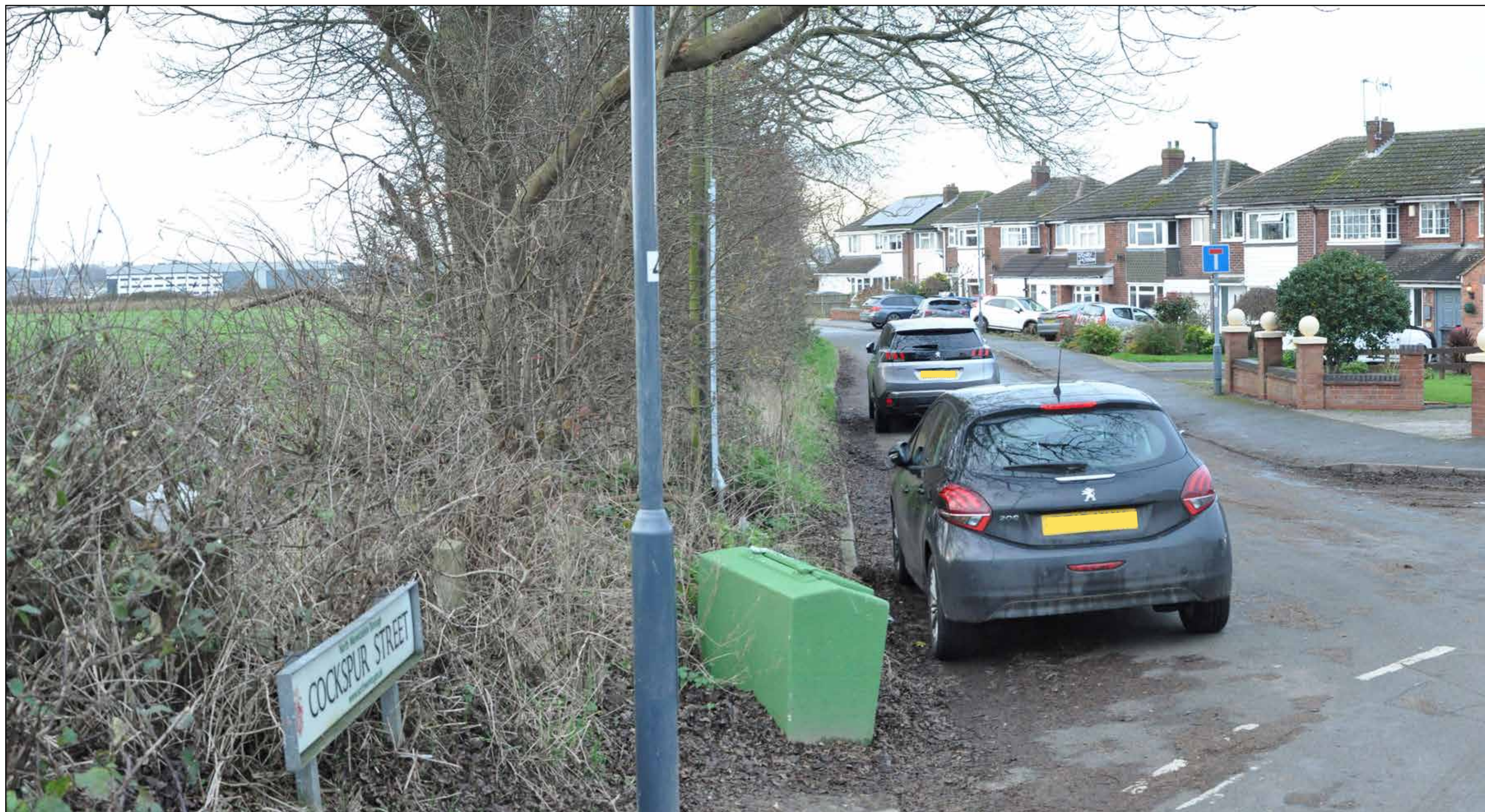
VIEWPOINT: 18 LOOKING WEST TOWARDS THE SITE FROM THE CORNER OF COCKSPUR STREET AND GREEN LANE.

PROJECTION: CYLINDRICAL DATE AND TIME OF PHOTOGRAPHY: 10.12.2020 AT 09:47 ENLARGEMENT FACTOR: 96% AT A1 MAKE AND MODEL OF CAMERA: NIKON D90 VIEW AT COMFORTABLE ARM'S LENGTH MAKE AND FOCAL LENGTH OF LENS: NIKON 35MM TO BE PRINTED AT A1 FOR ASSESSMENT DIRECTION OF VIEW: WEST VIEWING BOX INCORPORATES UP TO 90° HORIZONTAL FIELD OF VIEW