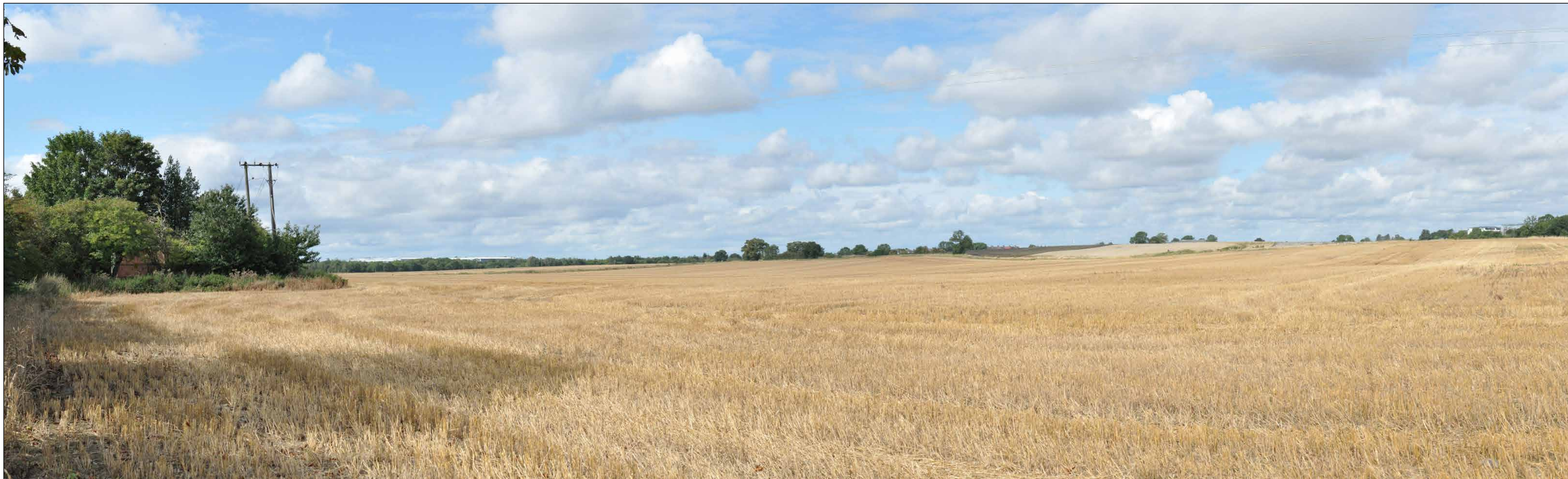
VIEWPOINT: 8 LOOKING NORTH-WEST TOWARDS THE SITE FROM WHERE WATLING STREET MEETS PROW AE46.

PROJECTION: CYLINDRICAL DATE AND TIME OF PHOTOGRAPHY: 06.09.2020 AT 13:00 ENLARGEMENT FACTOR: 96% AT A1 MAKE AND MODEL OF CAMERA: NIKON D90 VIEW AT COMFORTABLE ARM'S LENGTH MAKE AND FOCAL LENGTH OF LENS: NIKON 35MM TO BE PRINTED AT A1 FOR ASSESSMENT DIRECTION OF VIEW: NORTH-WEST VIEWING BOX INCORPORATES UP TO 90° HORIZONTAL FIELD OF VIEW