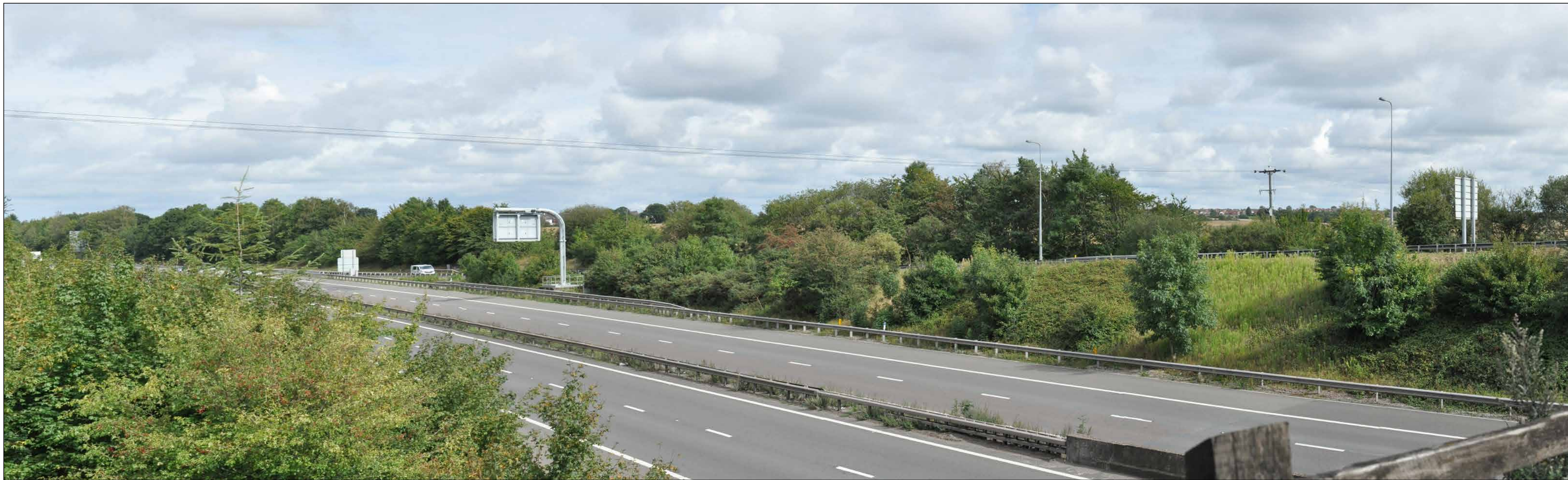
VIEWPOINT: 13 LOOKING NORTH-EAST TOWARDS THE SITE FROM THE FOOTPATH AT JUNCTION 10.

PROJECTION: CYLINDRICAL DATE AND TIME OF PHOTOGRAPHY: 06.09.2020 AT 12:35 ENLARGEMENT FACTOR: 96% AT A1 MAKE AND MODEL OF CAMERA: NIKON D90 VIEW AT COMFORTABLE ARM'S LENGTH MAKE AND FOCAL LENGTH OF LENS: NIKON 35MM TO BE PRINTED AT A1 FOR ASSESSMENT DIRECTION OF VIEW: NORTH-EAST VIEWING BOX INCORPORATES UP TO 90° HORIZONTAL FIELD OF VIEW