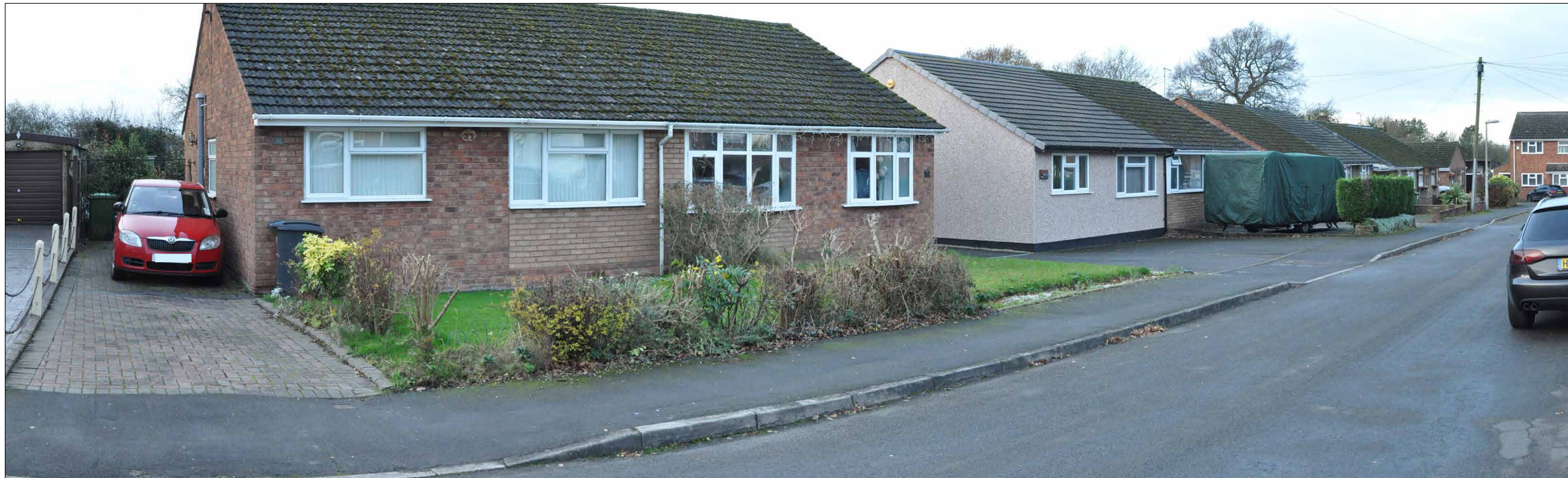
VIEWPOINT: 17 LOOKING SOUTH TOWARDS THE SITE FROM BETWEEN BUNGALOWS ON BIRCH GROVE.

SLR HODGETTS ESTATES TYPE 3 PHOTOGRAPHY WINTER PHOTOGRAPHY LAND AT JUNCTION 10, M42 LANDSCAPE AND VISUAL APPRAISAL JOB NO: 403.11077.0001 DATE: NOV 2022 DRAWN: RB CHECKED: EJ APPROVED: JS VIEWPOINT 17 DRAWING NO: LAJ-37