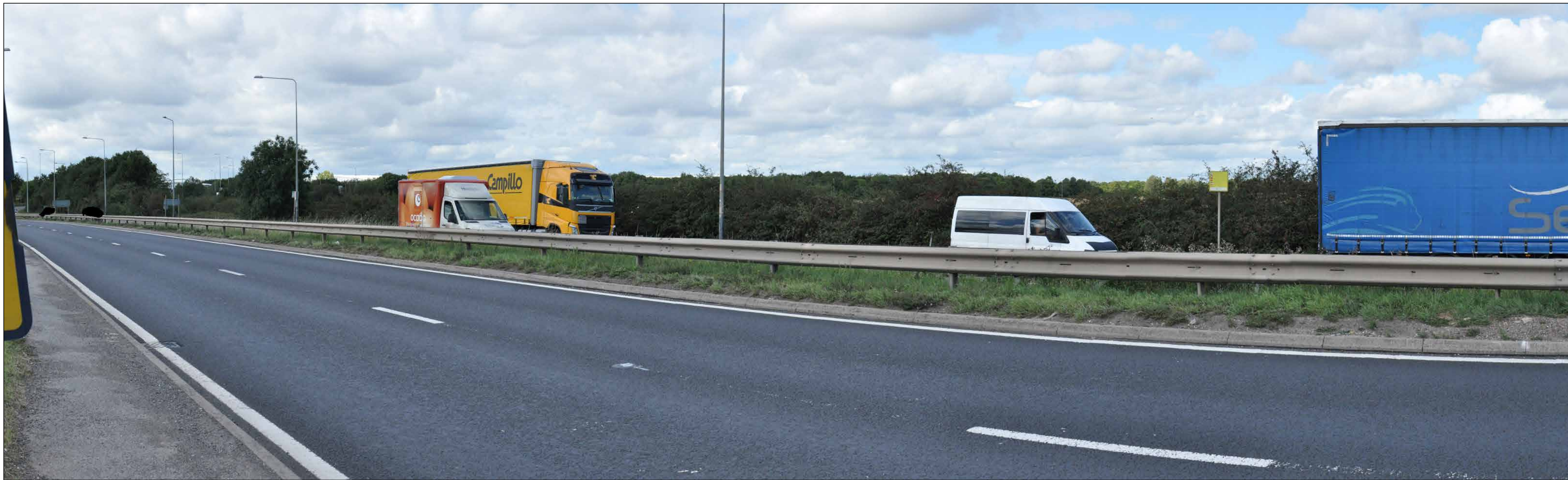
VIEWPOINT: 11 LOOKING NORTH-WEST TOWARDS THE SITE FROM WHERE PROW AE55 MEETS WATLING STREET.

PROJECTION: CYLINDRICAL ENLARGEMENT FACTOR: 96% AT A1 VIEW AT COMFORTABLE ARM'S LENGTH TO BE PRINTED AT A1 FOR ASSESSMENT VIEWING BOX INCORPORATES UP TO 90° HORIZONTAL FIELD OF VIEW DATE AND TIME OF PHOTOGRAPHY: 06.09.2020 AT 13:15 MAKE AND MODEL OF CAMERA: NIKON D90 MAKE AND FOCAL LENGTH OF LENS: NIKON 35MM DIRECTION OF VIEW: NORTH-WEST