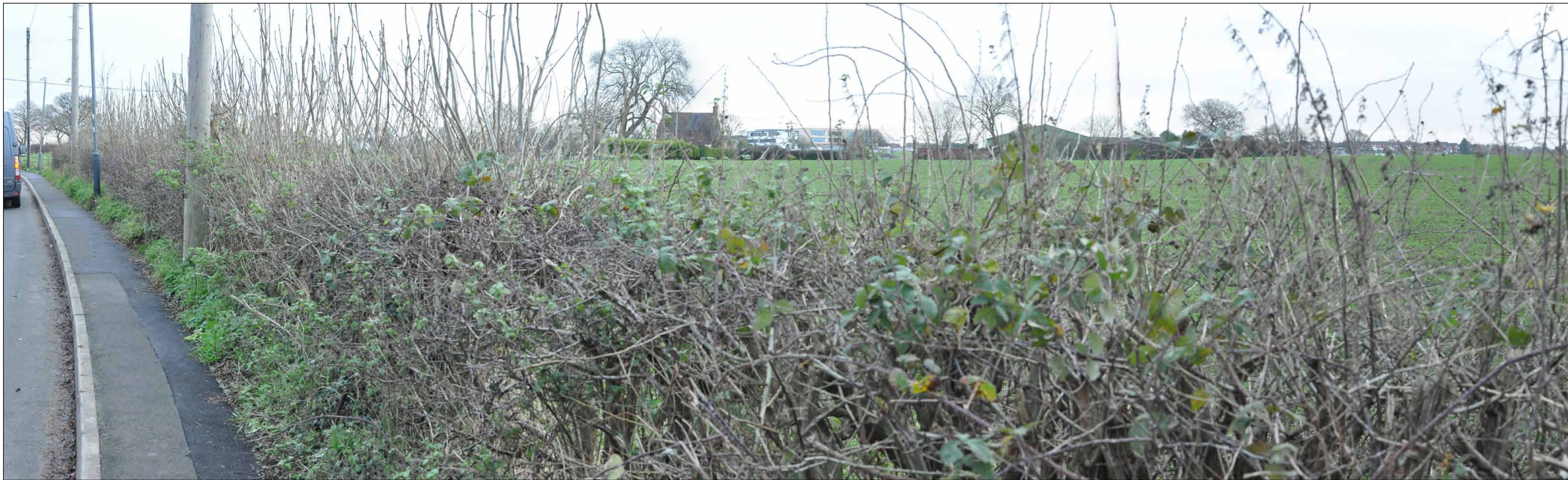
VIEWPOINT: 18 LOOKING EAST TOWARDS THE SITE FROM THE CORNER OF COCKSPUR STREET AND GREEN LANE.

PROJECTION: CYLINDRICAL DATE AND TIME OF PHOTOGRAPHY: 10.12.2020 AT 09:47 ENLARGEMENT FACTOR: 96% AT A1 MAKE AND MODEL OF CAMERA: NIKON D90 VIEW AT COMFORTABLE ARM'S LENGTH MAKE AND FOCAL LENGTH OF LENS: NIKON 35MM TO BE PRINTED AT A1 FOR ASSESSMENT DIRECTION OF VIEW: EAST VIEWING BOX INCORPORATES UP TO 90° HORIZONTAL FIELD OF VIEW