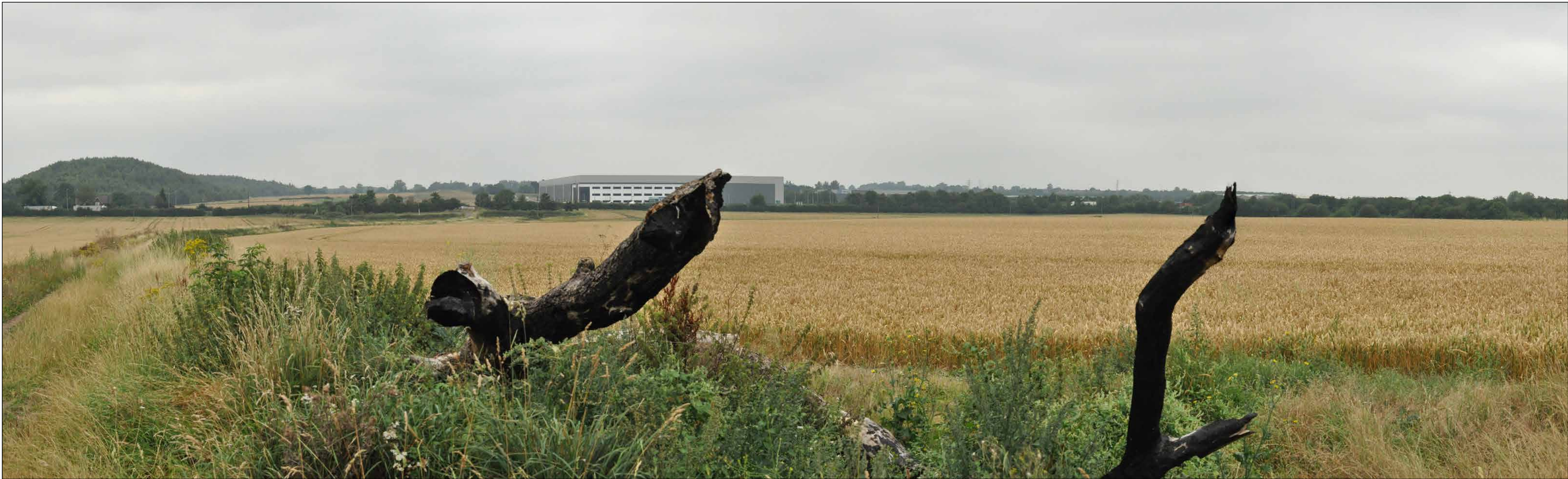
VIEWPOINT: 3 LOOKING SOUTH-WEST TOWARDS THE SITE FROM WHERE PROW AE45 MEETS AE46.

PROJECTION: CYLINDRICAL ENLARGEMENT FACTOR: 96% AT A1 VIEW AT COMFORTABLE ARM'S LENGTH TO BE PRINTED AT A1 FOR ASSESSMENT VIEWING BOX INCORPORATES UP TO 90° HORIZONTAL FIELD OF VIEW