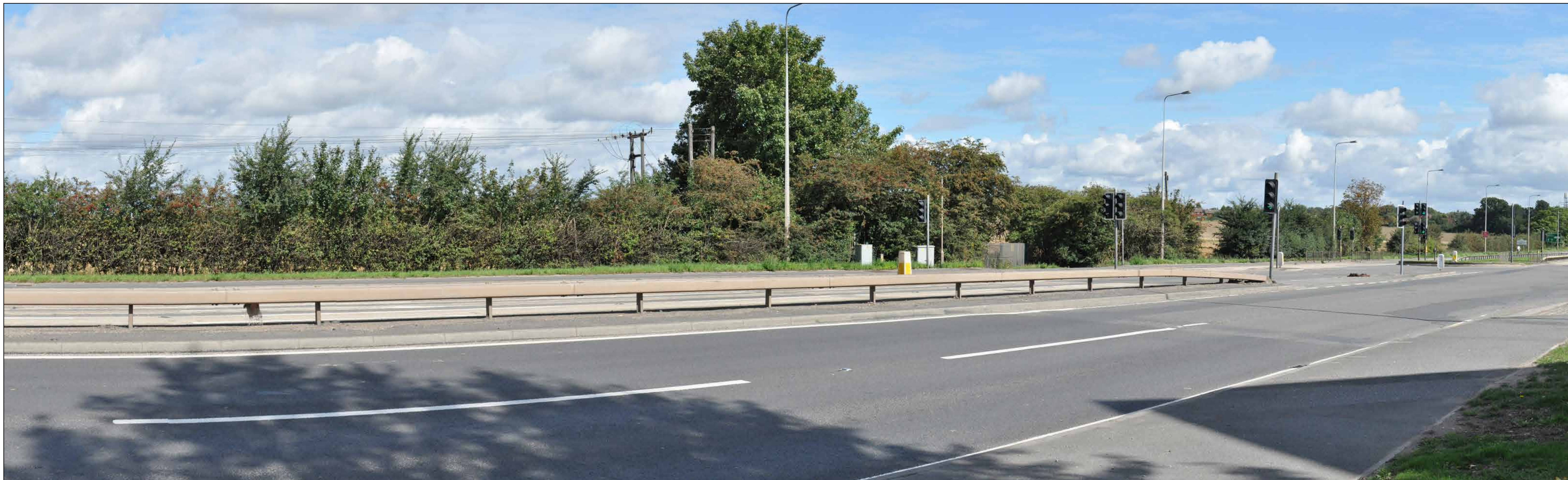
VIEWPOINT: 9 LOOKING NORTH-EAST TOWARDS DORDON FROM WHERE PROW AE52 MEETS WATLING STREET.

SLR HODGETTS ESTATES TYPE 3 PHOTOGRAPHY SUMMER PHOTOGRAPHY LAND AT JUNCTION 10, M42 LANDSCAPE AND VISUAL APPRAISAL JOB NO: 403.11077.0001 DATE: NOV 2022 DRAWN: RB CHECKED: EJ APPROVED: JS VIEWPOINT 9 DRAWING NO: LAJ-23