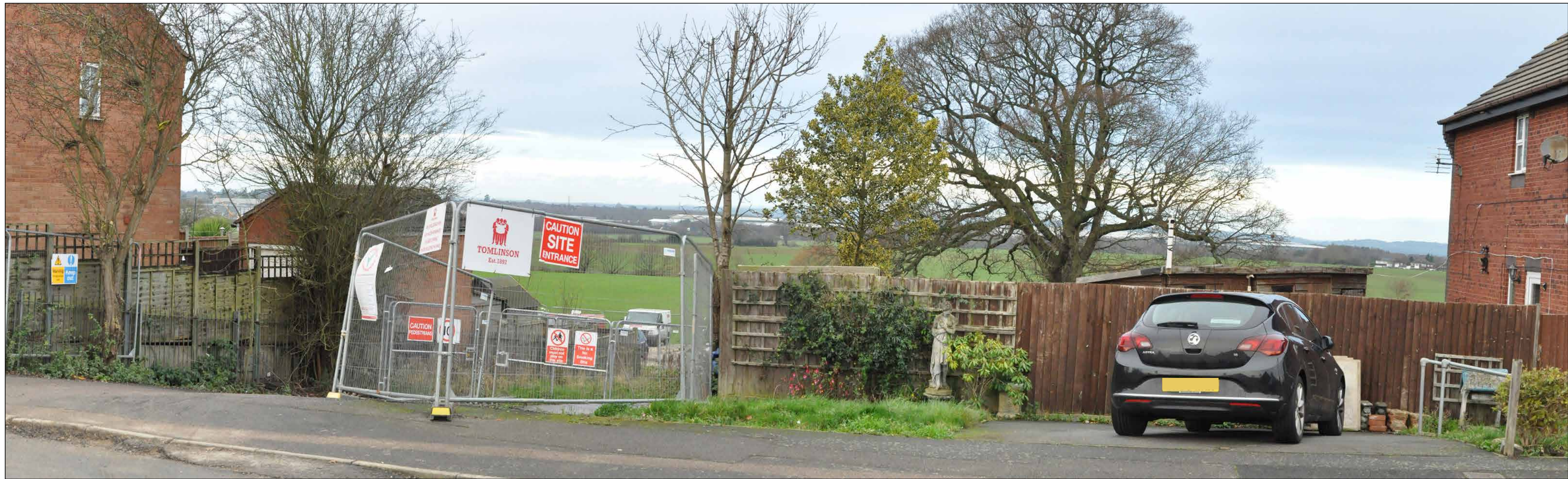
VIEWPOINT: 19 LOOKING WEST TOWARDS THE SITE FROM OFF BIRCHWOOD AVENUE AT ENTRANCE TO TOMLINSON CONSTRUCTION SITE.

PROJECTION: CYLINDRICAL ENLARGEMENT FACTOR: 96% AT A1 VIEW AT COMFORTABLE ARM'S LENGTH TO BE PRINTED AT A1 FOR ASSESSMENT VIEWING BOX INCORPORATES UP TO 90° HORIZONTAL FIELD OF VIEW DATE AND TIME OF PHOTOGRAPHY: 10.12.2020 AT 09:36 MAKE AND MODEL OF CAMERA: NIKON D90 MAKE AND FOCAL LENGTH OF LENS: NIKON 35MM DIRECTION OF VIEW: WEST