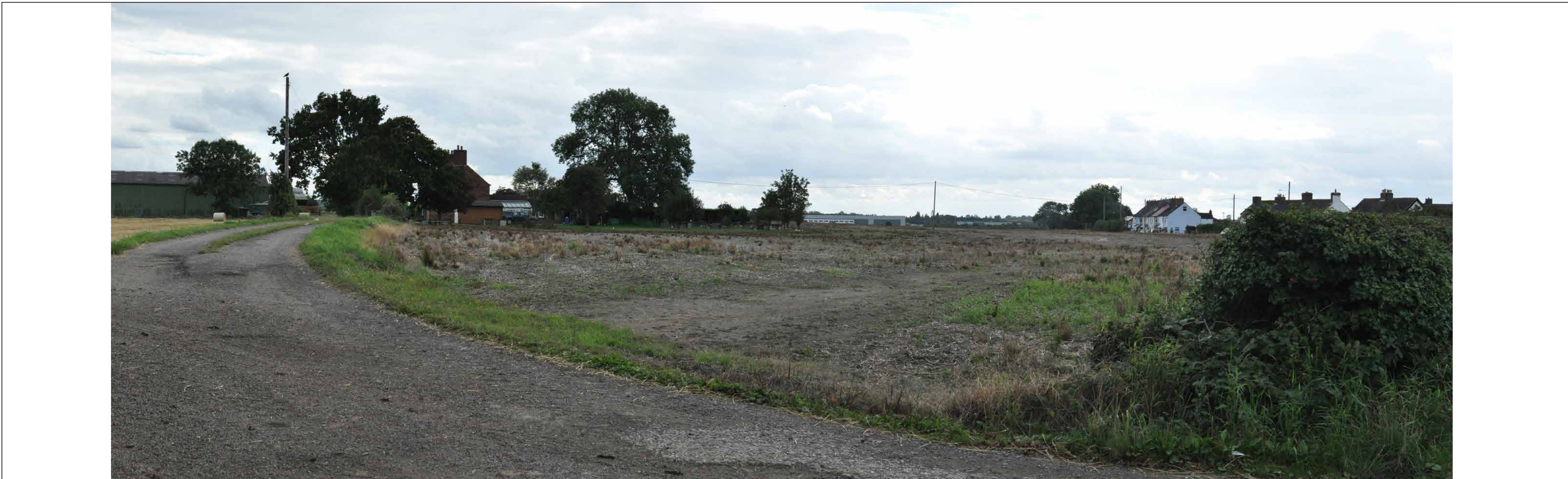
VIEWPOINT: 2 LOOKING SOUTH-WEST TOWARDS THE SITE FROM THE FOOTPATH ALONG BIRCHMOOR ROAD.

SLR HODGETTS ESTATES digital environmental solutions LAND AT JUNCTION 10, M42 LANDSCAPE AND VISUAL APPRAISAL JOB NO: 403.11077.0001 DATE: NOV 2022 DRAWN: RB CHECKED: EJ APPROVED: JS VIEWPOINT 1 DRAWING NO: LAJ-7