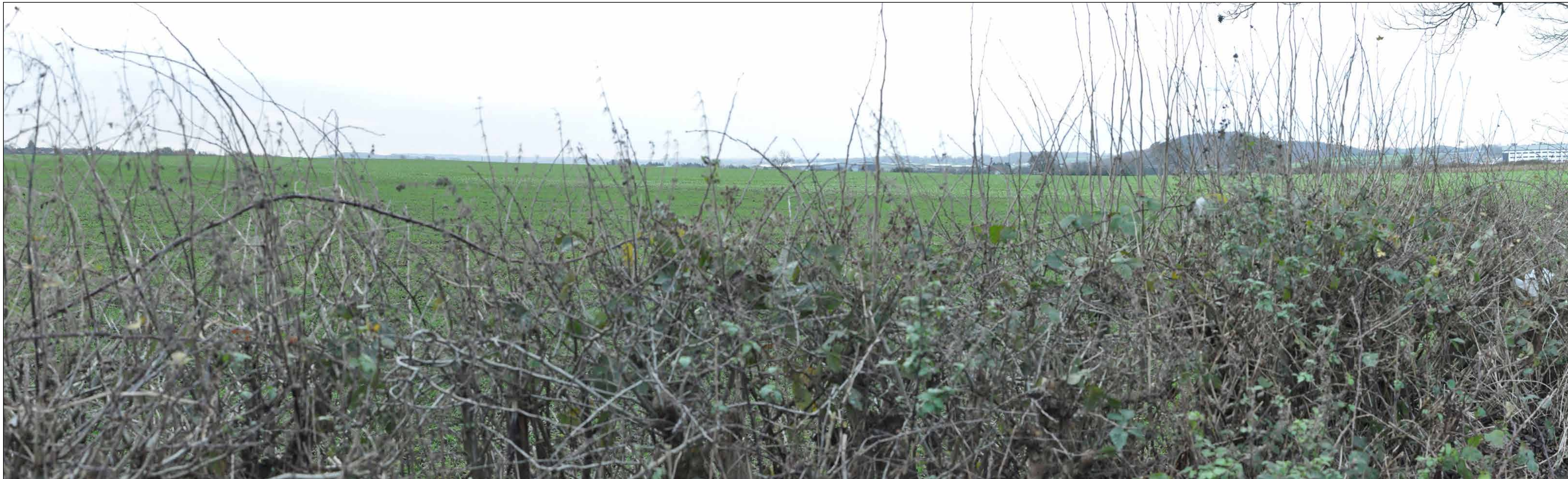
VIEWPOINT: 18 LOOKING SOUTH TOWARDS THE SITE FROM THE CORNER OF COCKSPUR STREET AND GREEN LANE.

SLR HODGETTS ESTATES TYPE 3 PHOTOGRAPHY LAND AT JUNCTION 10, M42 LANDSCAPE AND VISUAL APPRAISAL JOB NO: 403.11077.0001 DATE: NOV 2022 DRAWN: RB CHECKED: EJ APPROVED: JS VIEWPOINT 18 DRAWING NO: LAJ-39