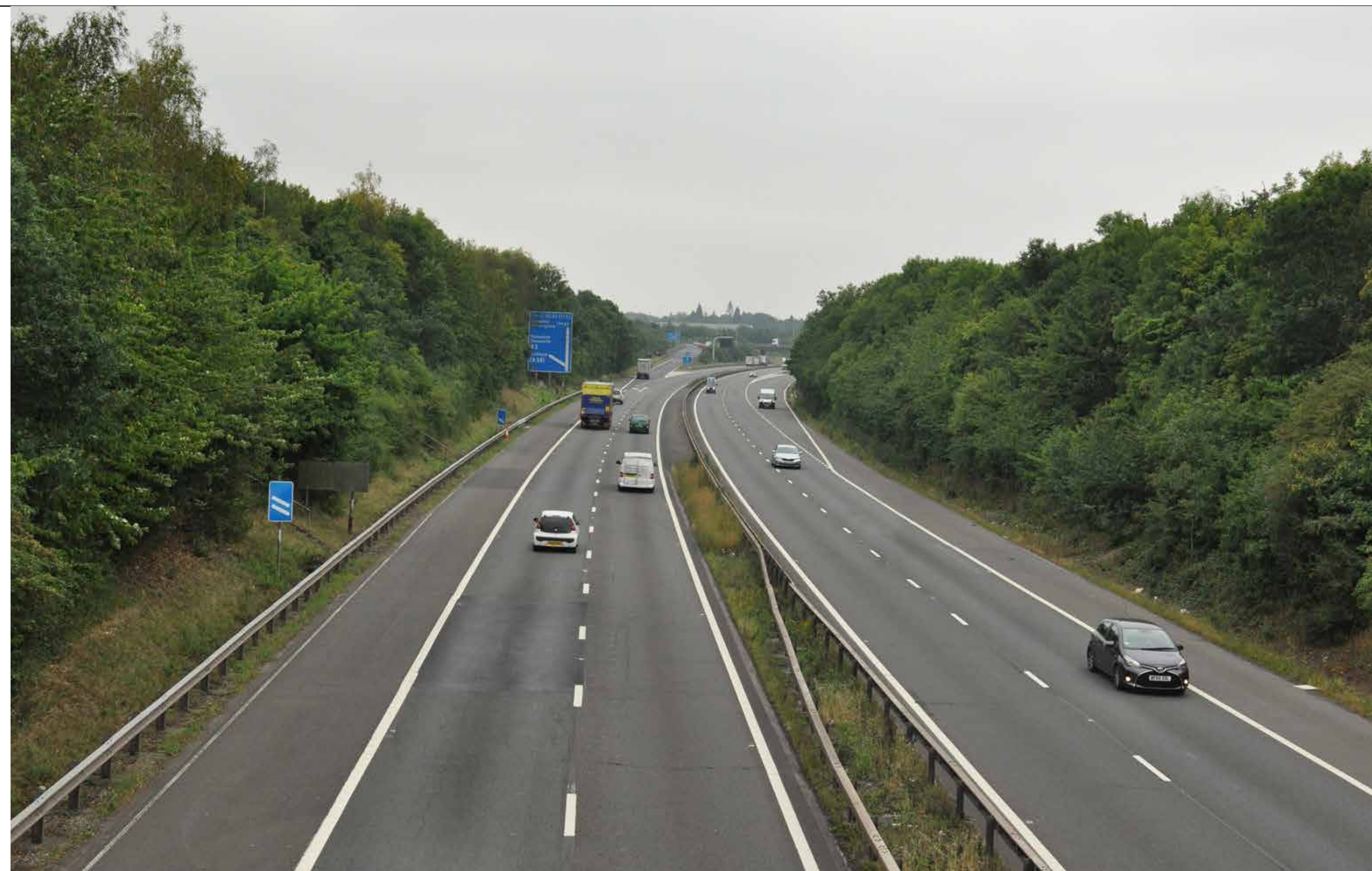
VIEWPOINT: 16 LOOKING SOUTH ALONG THE M42 TOWARDS JUNCTION 10 FROM THE BRIDGE AT BIRCHMOOR.

PROJECTION: CYLINDRICAL DATE AND TIME OF PHOTOGRAPHY: 14.08.2020 AT 09:55 ENLARGEMENT FACTOR: 96% AT A1 MAKE AND MODEL OF CAMERA: NIKON D90 VIEW AT COMFORTABLE ARM'S LENGTH MAKE AND FOCAL LENGTH OF LENS: NIKON 35MM TO BE PRINTED AT A1 FOR ASSESSMENT DIRECTION OF VIEW: SOUTH VIEWING BOX INCORPORATES UP TO 90° HORIZONTAL FIELD OF VIEW