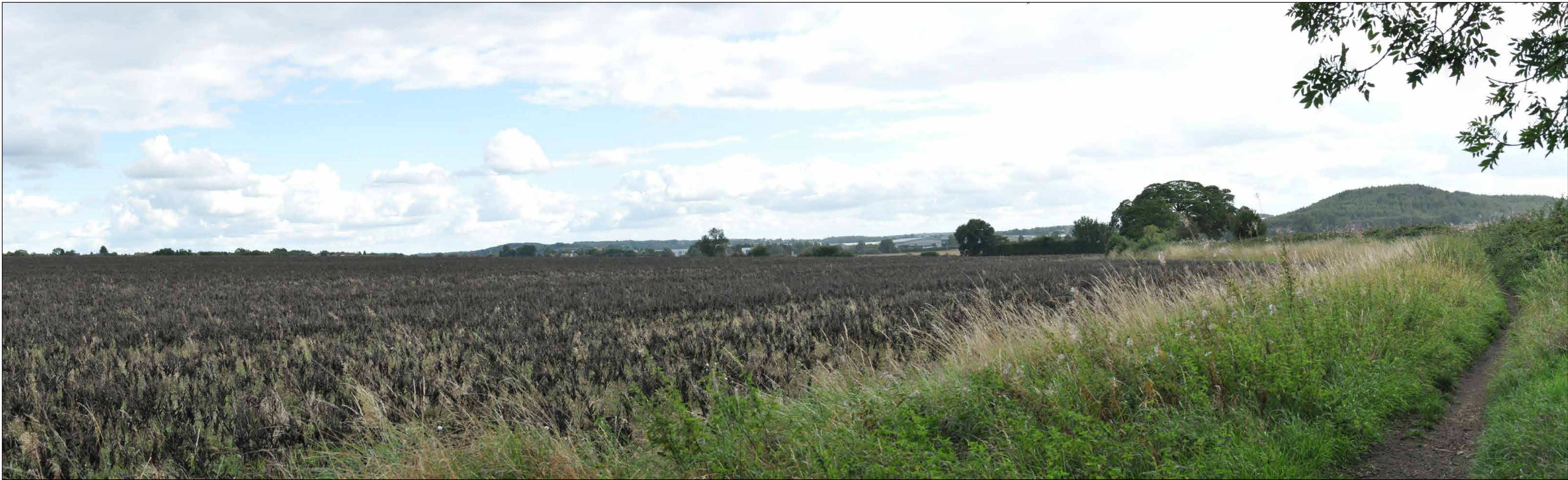
VIEWPOINT: 1 LOOKING SOUTH-EAST TOWARDS DORDON FROM PROW AE45.

SLR HODGETTS ESTATES an environmental solutions LAND AT JUNCTION 10, M42 LANDSCAPE AND VISUAL APPRAISAL JOB NO: 403.11077.0001 DATE: NOV 2022 DRAWN: RB CHECKED: EJ APPROVED: JS VIEWPOINT 1 DRAWING NO: LAJ-5