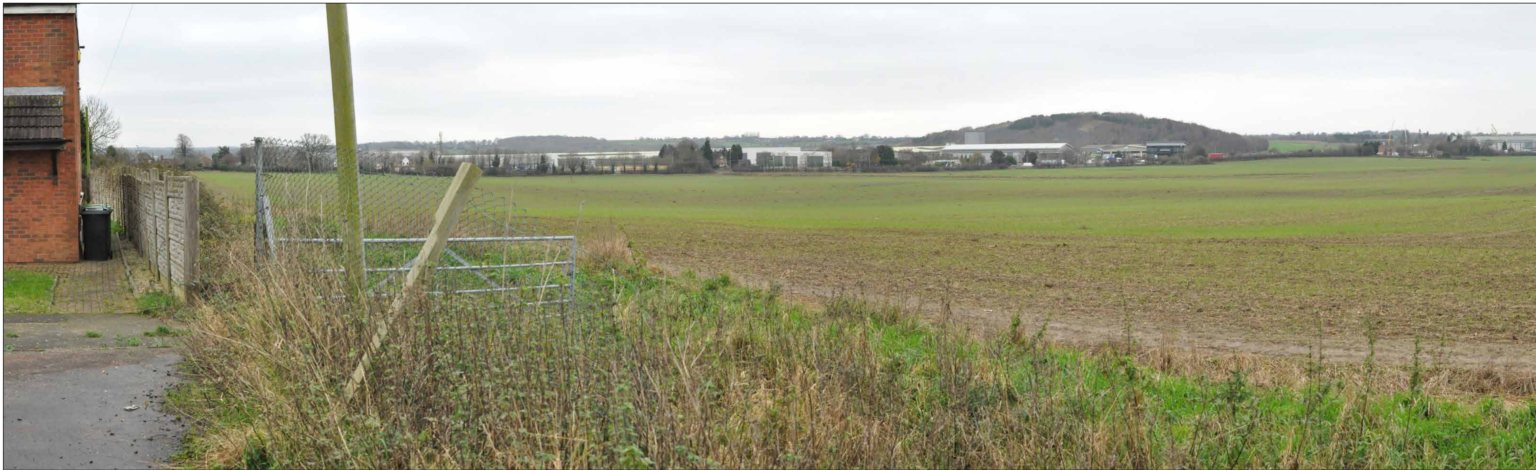
VIEWPOINT: 20 LOOKING SOUTH TOWARDS THE SITE FROM AT THE END OF BARN CLOSE.

PROJECTION: CYLINDRICAL DATE AND TIME OF PHOTOGRAPHY: 10.12.2020 AT 09:15 ENLARGEMENT FACTOR: 96% AT A1 MAKE AND MODEL OF CAMERA: NIKON D90 VIEW AT COMFORTABLE ARM'S LENGTH MAKE AND FOCAL LENGTH OF LENS: NIKON 35MM TO BE PRINTED AT A1 FOR ASSESSMENT DIRECTION OF VIEW: SOUTH VIEWING BOX INCORPORATES UP TO 90° HORIZONTAL FIELD OF VIEW