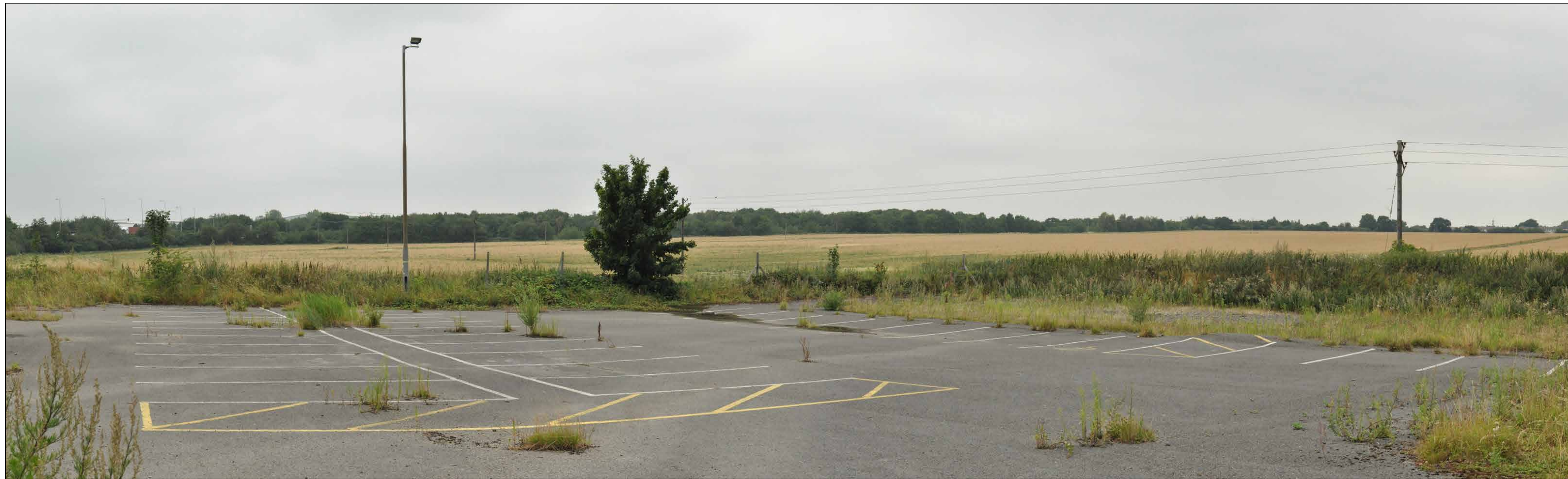
VIEWPOINT: 10 LOOKING NORTH-WEST TOWARDS THE SITE FROM PROW AE45.

PROJECTION: CYLINDRICAL DATE AND TIME OF PHOTOGRAPHY: 14.08.2020 AT 11:10 ENLARGEMENT FACTOR: 96% AT A1 MAKE AND MODEL OF CAMERA: NIKON D90 VIEW AT COMFORTABLE ARM'S LENGTH MAKE AND FOCAL LENGTH OF LENS: NIKON 35MM TO BE PRINTED AT A1 FOR ASSESSMENT DIRECTION OF VIEW: NORTH-WEST VIEWING BOX INCORPORATES UP TO 90° HORIZONTAL FIELD OF VIEW