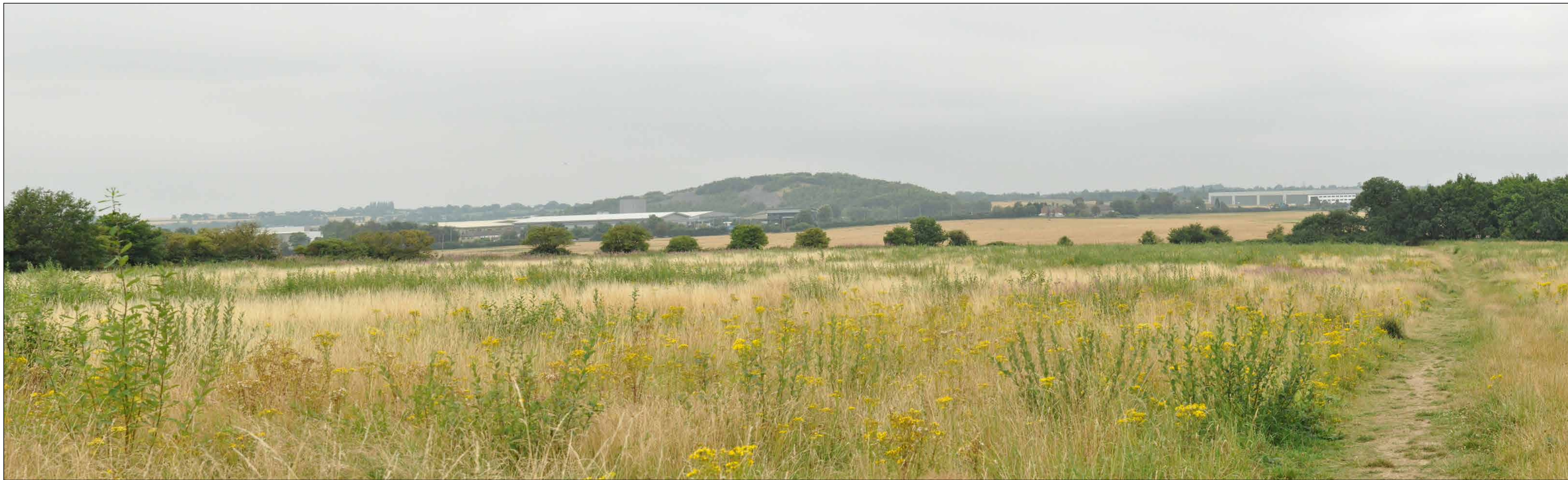
VIEWPOINT: 5 LOOKING SOUTH-WEST TOWARDS THE SITE FROM THE EDGE OF DORDON.

PROJECTION: CYLINDRICAL DATE AND TIME OF PHOTOGRAPHY: 14.08.2020 AT 10:25 ENLARGEMENT FACTOR: 96% AT A1 MAKE AND MODEL OF CAMERA: NIKON D90 VIEW AT COMFORTABLE ARM'S LENGTH MAKE AND FOCAL LENGTH OF LENS: NIKON 35MM TO BE PRINTED AT A1 FOR ASSESSMENT DIRECTION OF VIEW: SOUTH-WEST VIEWING BOX INCORPORATES UP TO 90° HORIZONTAL FIELD OF VIEW