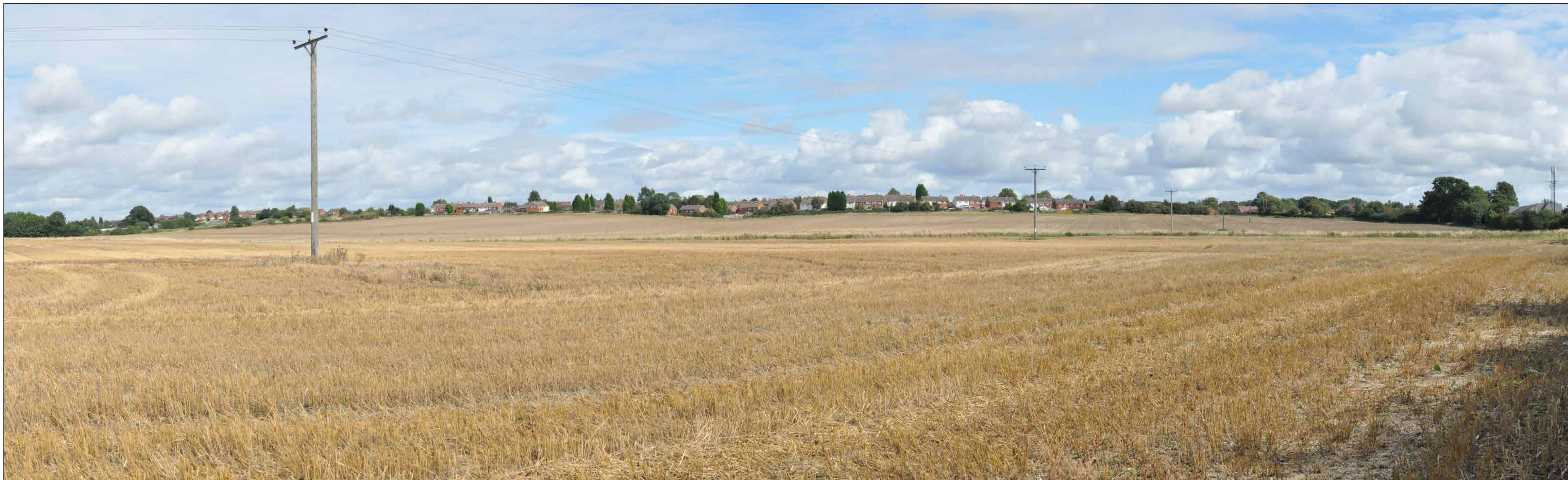
VIEWPOINT: 8 LOOKING NORTH-EAST TOWARDS DORDON FROM WHERE WATLING STREET MEETS PROW AE46

PROJECTION: CYLINDRICAL DATE AND TIME OF PHOTOGRAPHY: 06.09.2020 AT 13:00 ENLARGEMENT FACTOR: 96% AT A1 MAKE AND MODEL OF CAMERA: NIKON D90 VIEW AT COMFORTABLE ARM'S LENGTH MAKE AND FOCAL LENGTH OF LENS: NIKON 35MM TO BE PRINTED AT A1 FOR ASSESSMENT DIRECTION OF VIEW: NORTH-EAST VIEWING BOX INCORPORATES UP TO 90° HORIZONTAL FIELD OF VIEW