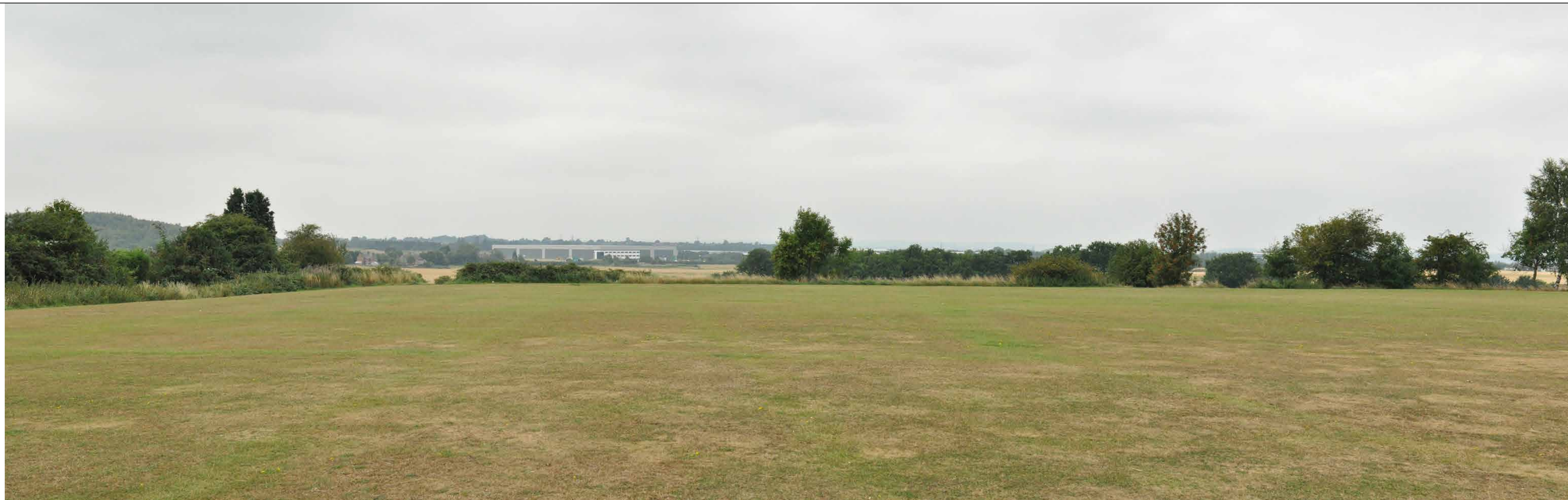
VIEWPOINT: 6 LOOKING SOUTH-WEST TOWARDS THE SITE FROM THE PUBLIC OPEN SPACE AT DORDON.

PROJECTION: CYLINDRICAL DATE AND TIME OF PHOTOGRAPHY: 14.08.2020 AT 11:40 ENLARGEMENT FACTOR: 96% AT A1 MAKE AND MODEL OF CAMERA: NIKON D90 VIEW AT COMFORTABLE ARM'S LENGTH MAKE AND FOCAL LENGTH OF LENS: NIKON 35MM TO BE PRINTED AT A1 FOR ASSESSMENT DIRECTION OF VIEW: SOUTH-WEST VIEWING BOX INCORPORATES UP TO 90° HORIZONTAL FIELD OF VIEW