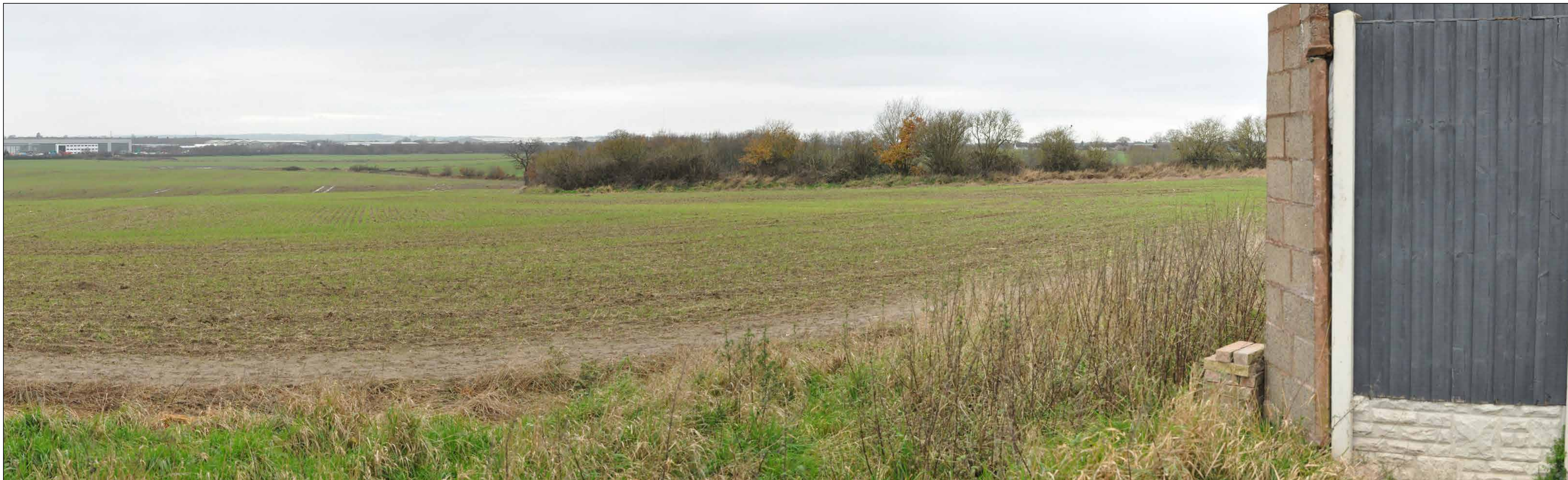
VIEWPOINT: 20 LOOKING WEST TOWARDS THE SITE FROM AT THE END OF BARN CLOSE.

SLR HODGETTS ESTATES TYPE 3 PHOTOGRAPHY LAND AT JUNCTION 10, M42 LANDSCAPE AND VISUAL APPRAISAL JOB NO: 403.11077.0001 DATE: NOV 2022 DRAWN: RB CHECKED: EJ APPROVED: JS VIEWPOINT 20 DRAWING NO: LAJ-45