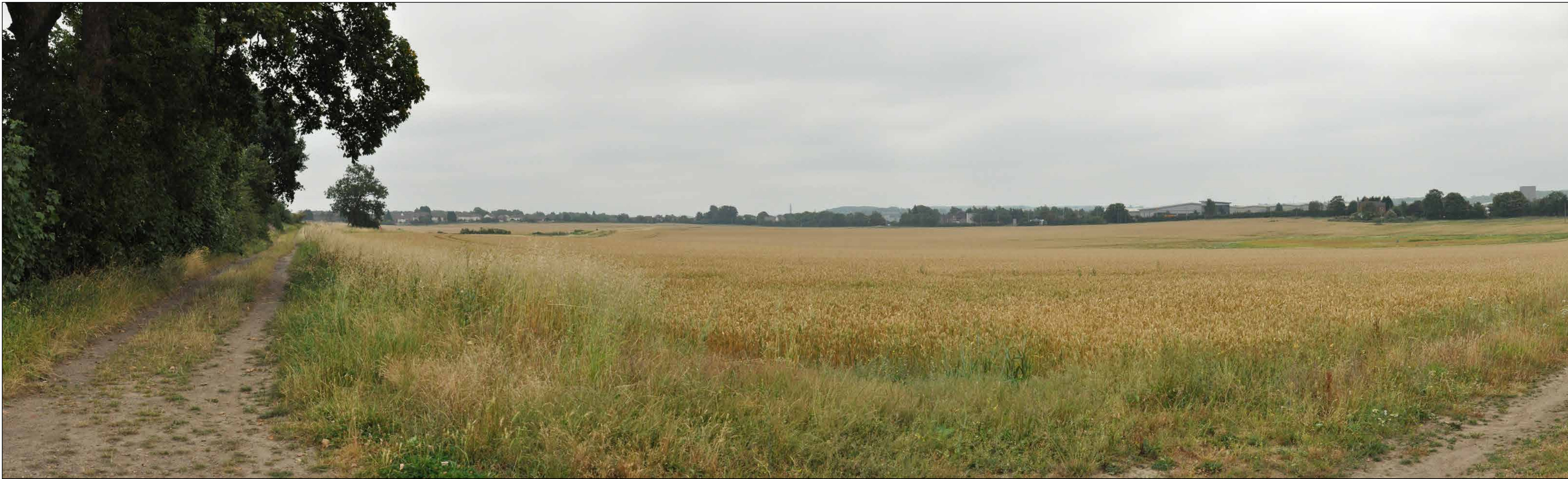
VIEWPOINT: 3 LOOKING SOUTH-EAST TOWARDS DORDON FROM WHERE PROW AE45 MEETS AE46.

PROJECTION: CYLINDRICAL ENLARGEMENT FACTOR: 96% AT A1 VIEW AT COMFORTABLE ARM'S LENGTH TO BE PRINTED AT A1 FOR ASSESSMENT VIEWING BOX INCORPORATES UP TO 90° HORIZONTAL FIELD OF VIEW