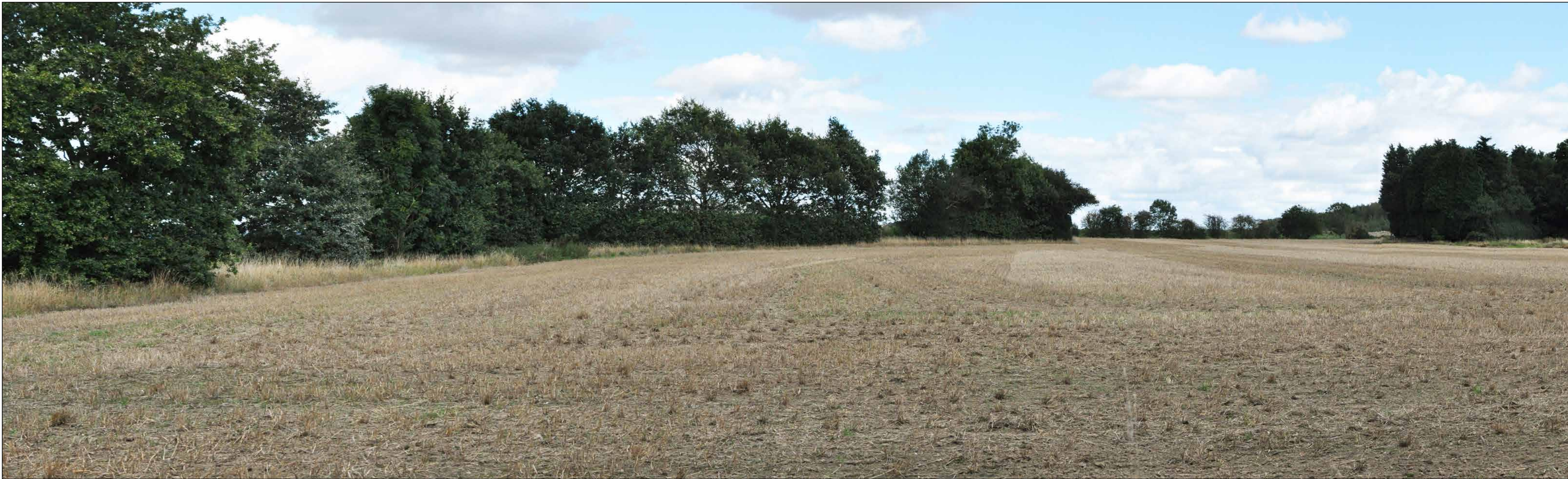
VIEWPOINT: 12 LOOKING NORTH-EAST TOWARDS THE SITE FROM PROW AE55.

PROJECTION: CYLINDRICAL ENLARGEMENT FACTOR: 96% AT A1 VIEW AT COMFORTABLE ARM'S LENGTH TO BE PRINTED AT A1 FOR ASSESSMENT VIEWING BOX INCORPORATES UP TO 90° HORIZONTAL FIELD OF VIEW