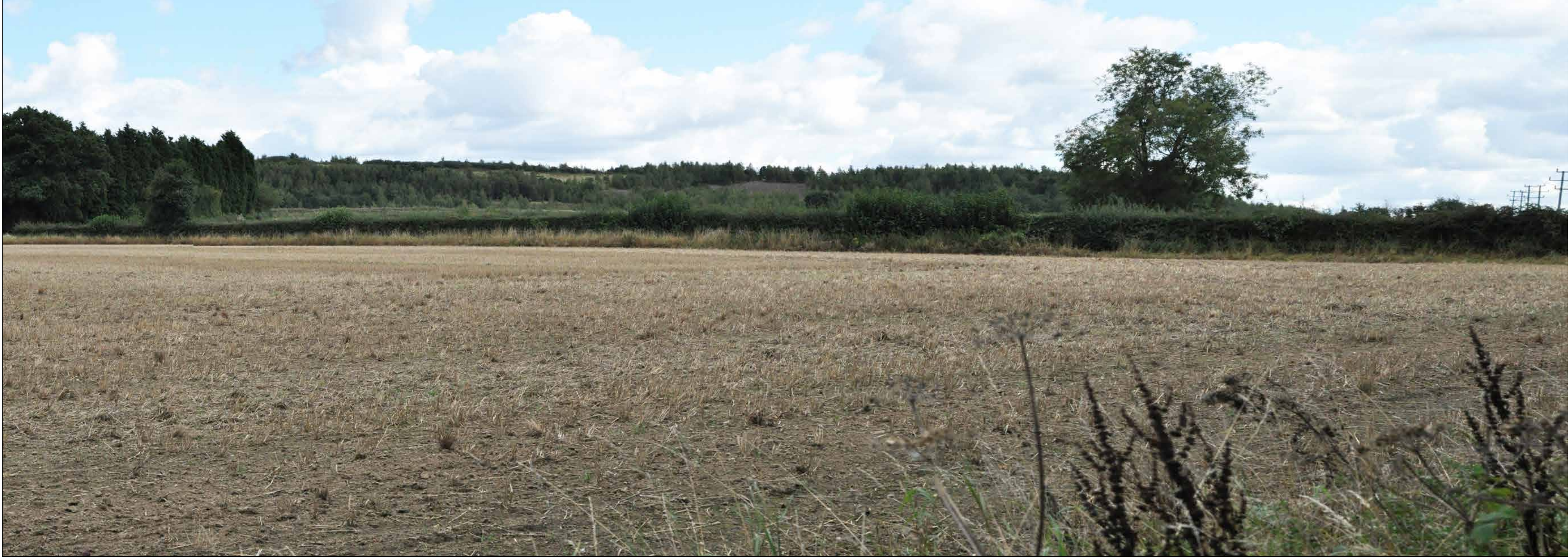
VIEWPOINT: 12 LOOKING SOUTH-EAST TOWARDS BIRCH COPPICE BUSINESS PARK FROM PROW AE55.

SLR HODGETTS ESTATES digital environmental solutions LAND AT JUNCTION 10, M42 LANDSCAPE AND VISUAL APPRAISAL JOB NO: 403.11077.0001 DATE: NOV 2022 DRAWN: RB CHECKED: EJ APPROVED: JS VIEWPOINT 12 DRAWING NO: LAJ-29