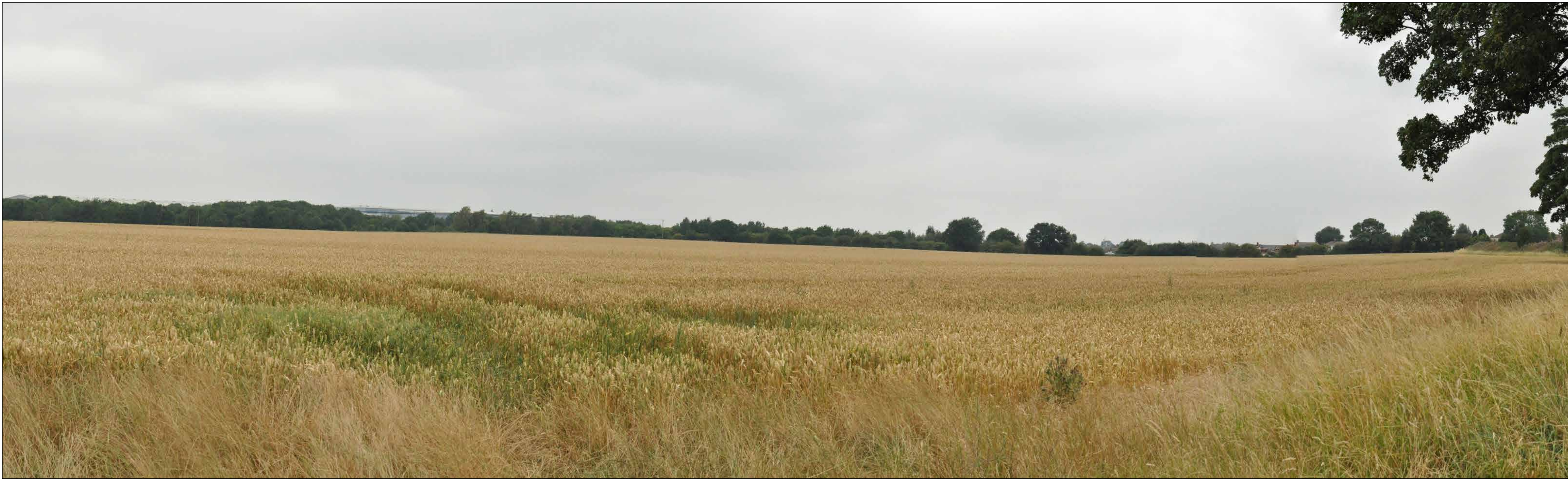
VIEWPOINT: 3 LOOKING NORTH-WEST TOWARDS THE SITE FROM WHERE PROW AE45 MEETS AE46.

PROJECTION: CYLINDRICAL ENLARGEMENT FACTOR: 96% AT A1 VIEW AT COMFORTABLE ARM'S LENGTH TO BE PRINTED AT A1 FOR ASSESSMENT VIEWING BOX INCORPORATES UP TO 90° HORIZONTAL FIELD OF VIEW