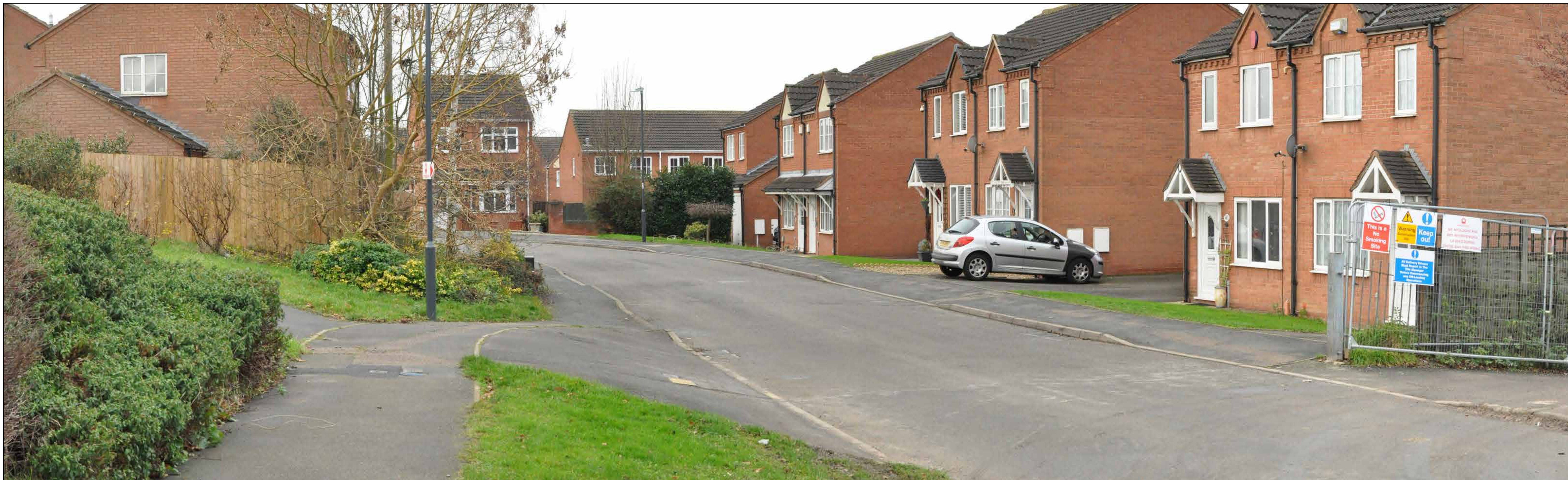
VIEWPOINT: 19 LOOKING SOUTH TOWARDS THE SITE FROM OFF BIRCHWOOD AVENUE AT ENTRANCE TO TOMLINSON CONSTRUCTION SITE.

SLR HODGETTS ESTATES TYPE 3 PHOTOGRAPHY LAND AT JUNCTION 10, M42 LANDSCAPE AND VISUAL APPRAISAL JOB NO: 403.11077.0001 DATE: NOV 2022 DRAWN: RB CHECKED: EJ APPROVED: JS VIEWPOINT 18 DRAWING NO: LAJ-41