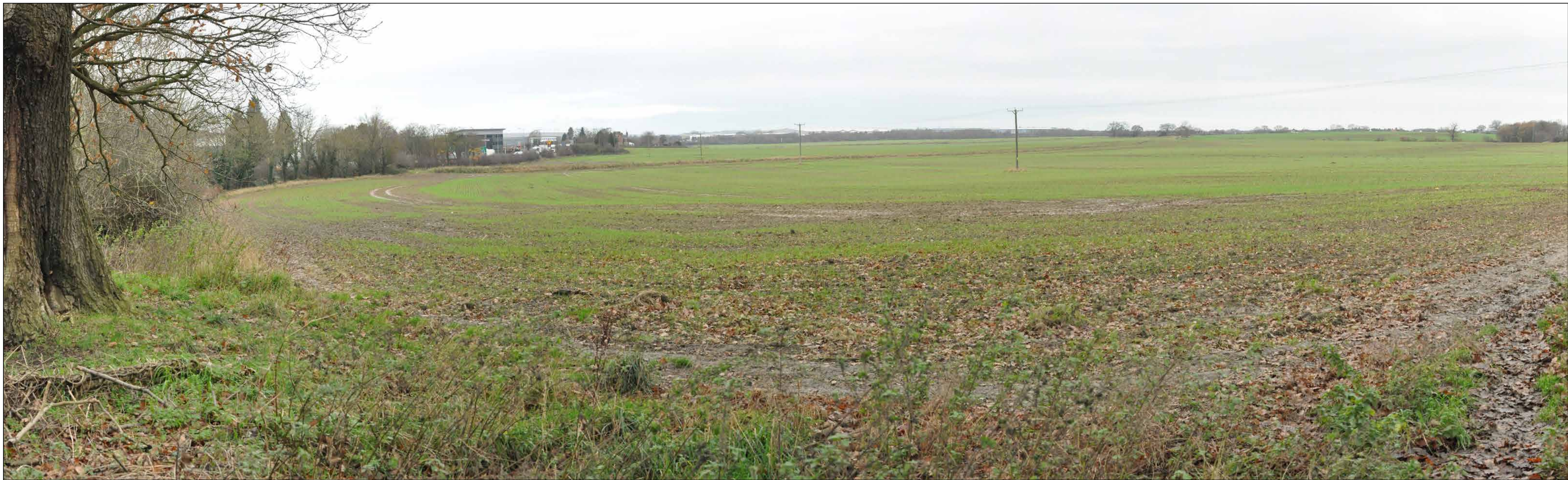
VIEWPOINT: 21 LOOKING WEST TOWARDS THE SITE FROM FOOTPATH AE48 AT THE EDGE OF BROWN'S LANE.

PROJECTION: CYLINDRICAL DATE AND TIME OF PHOTOGRAPHY: 10.12.2020 AT 09:25 ENLARGEMENT FACTOR: 96% AT A1 MAKE AND MODEL OF CAMERA: NIKON D90 VIEW AT COMFORTABLE ARM'S LENGTH MAKE AND FOCAL LENGTH OF LENS: NIKON 35MM TO BE PRINTED AT A1 FOR ASSESSMENT DIRECTION OF VIEW: WEST VIEWING BOX INCORPORATES UP TO 90° HORIZONTAL FIELD OF VIEW