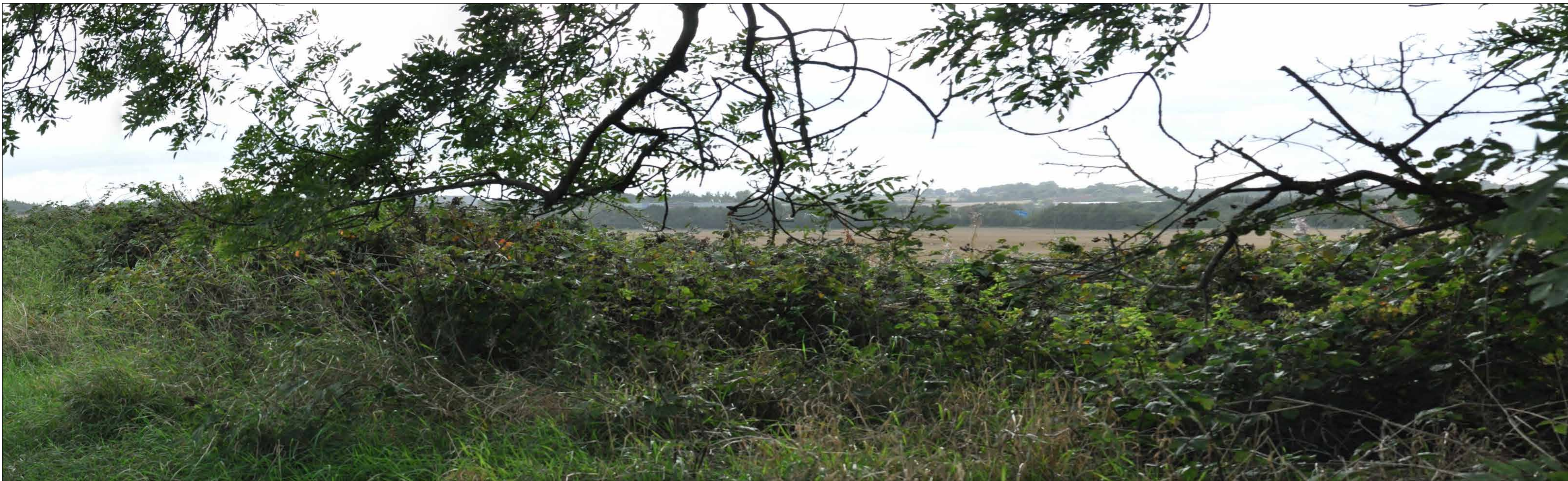
VIEWPOINT: 1 LOOKING SOUTH-WEST TOWARDS THE SITE FROM PROW AE45.

PROJECTION: CYLINDRICAL DATE AND TIME OF PHOTOGRAPHY: 06.09.2020 AT 14:45 ENLARGEMENT FACTOR: 96% AT A1 MAKE AND MODEL OF CAMERA: NIKON D90 VIEW AT COMFORTABLE ARM'S LENGTH MAKE AND FOCAL LENGTH OF LENS: NIKON 35MM TO BE PRINTED AT A1 FOR ASSESSMENT DIRECTION OF VIEW: SOUTH-WEST VIEWING BOX INCORPORATES UP TO 90° HORIZONTAL FIELD OF VIEW