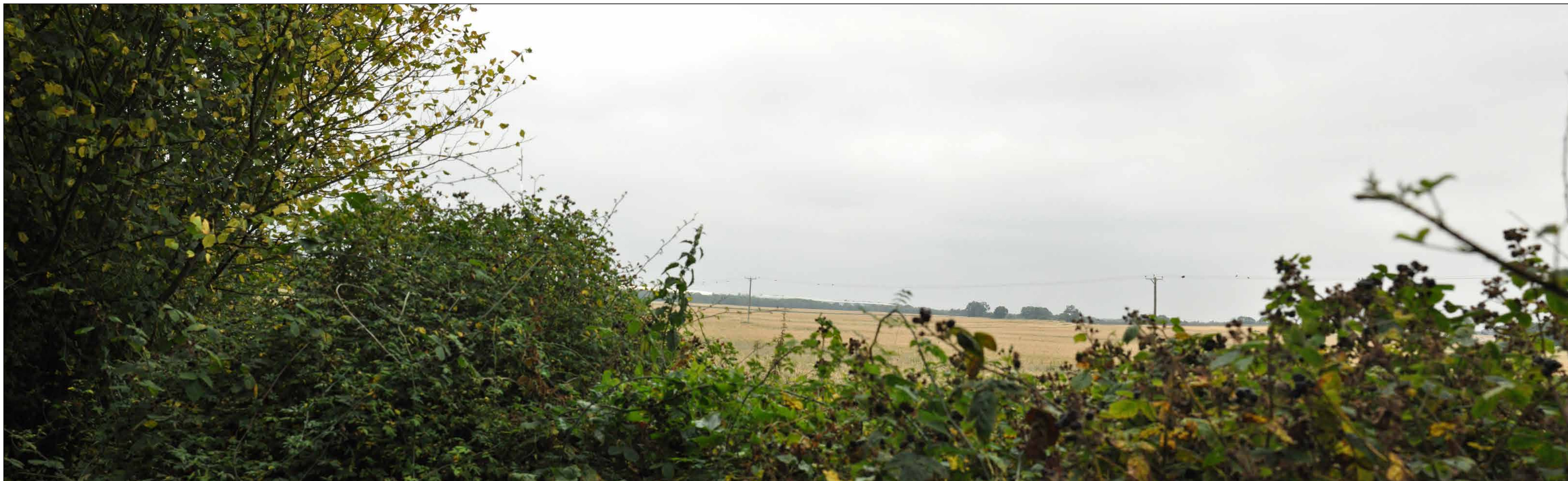
VIEWPOINT: 7 LOOKING NORTH-WEST TOWARDS BIRCHMOOR FROM PROW AE48.

SLR HODGETTS ESTATES digital environmental solutions LAND AT JUNCTION 10, M42 LANDSCAPE AND VISUAL APPRAISAL JOB NO: 403.11077.00001 DATE: NOV 2022 DRAWN: RB CHECKED: EJ APPROVED: JS VIEWPOINT 6 DRAWING NO: LAJ-19