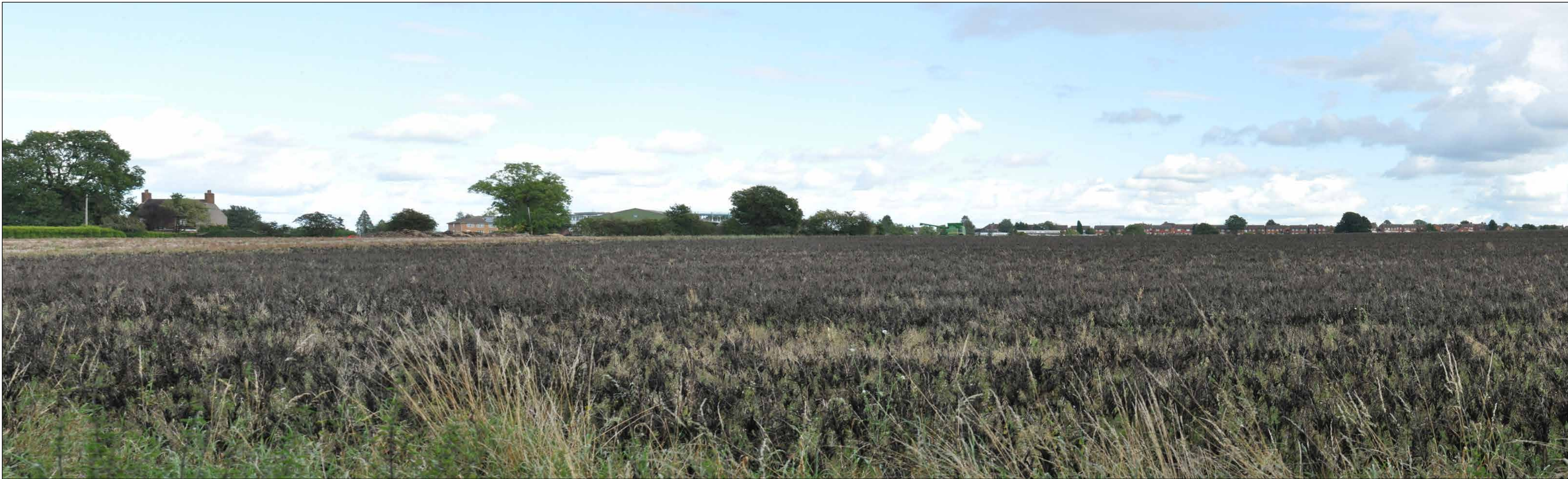
VIEWPOINT: 1 LOOKING NORTH-EAST TOWARDS ST HELENA FROM PROW AE45.

PROJECTION: CYLINDRICAL DATE AND TIME OF PHOTOGRAPHY: 06.09.2020 AT 14:45 ENLARGEMENT FACTOR: 96% AT A1 MAKE AND MODEL OF CAMERA: NIKON D90 VIEW AT COMFORTABLE ARM'S LENGTH MAKE AND FOCAL LENGTH OF LENS: NIKON 35MM TO BE PRINTED AT A1 FOR ASSESSMENT DIRECTION OF VIEW: NORTH-EAST VIEWING BOX INCORPORATES UP TO 90° HORIZONTAL FIELD OF VIEW